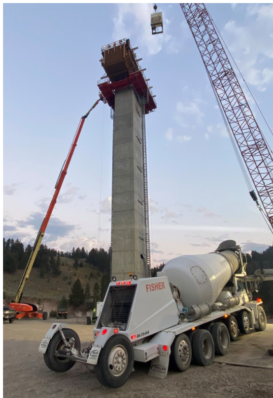
Pier 2 Pour Beginning