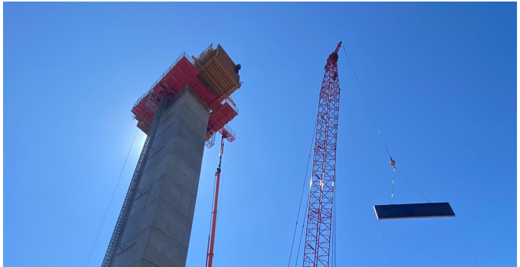
Pier 2 Cap Form Assembly