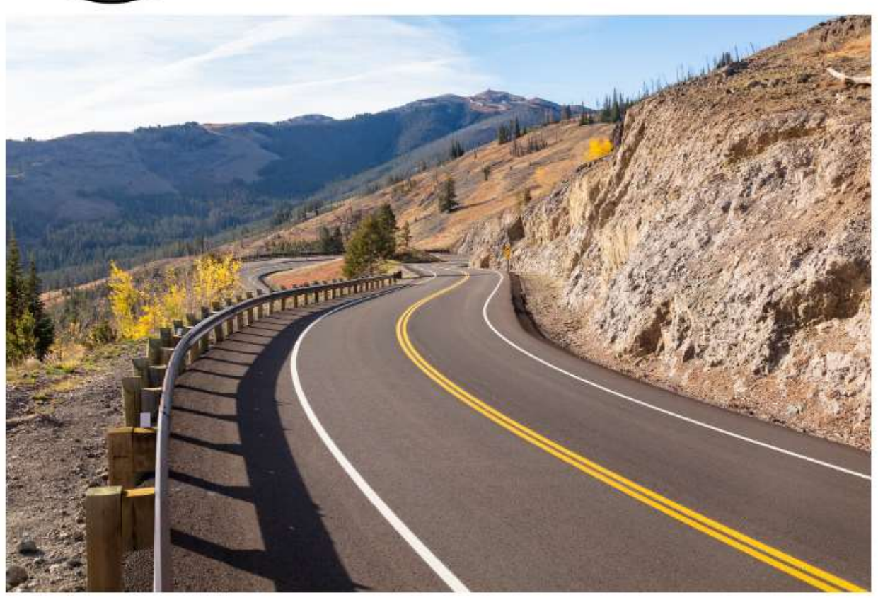
Road reconstruction made possible with a NSFLTP program grant.