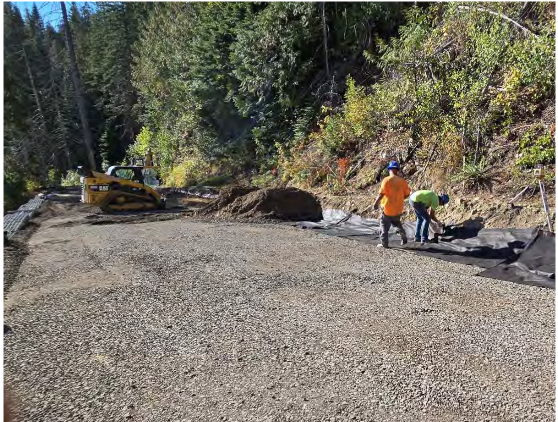
Ditch shaping and subgrade construction M.P. 2.52 FSR 470

FSR470, Swiftwater Road, remains closed to thru traffic from the Selway River to the junction of FSR653 and will remain closed until project completion around the middle of October. Please refer to your local USFS office for further details.