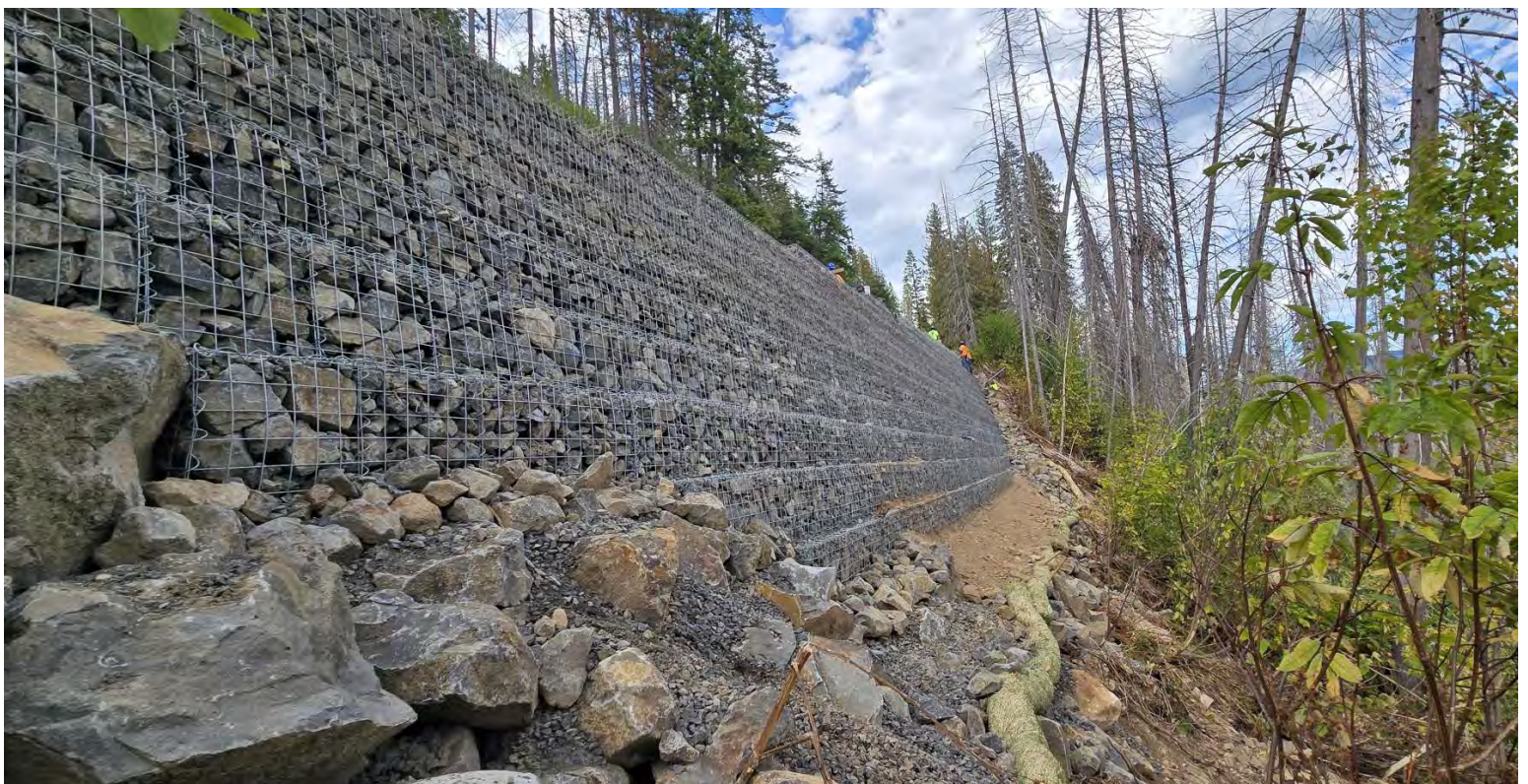
RSS wall construction, M.P. 2.52 FSR 470