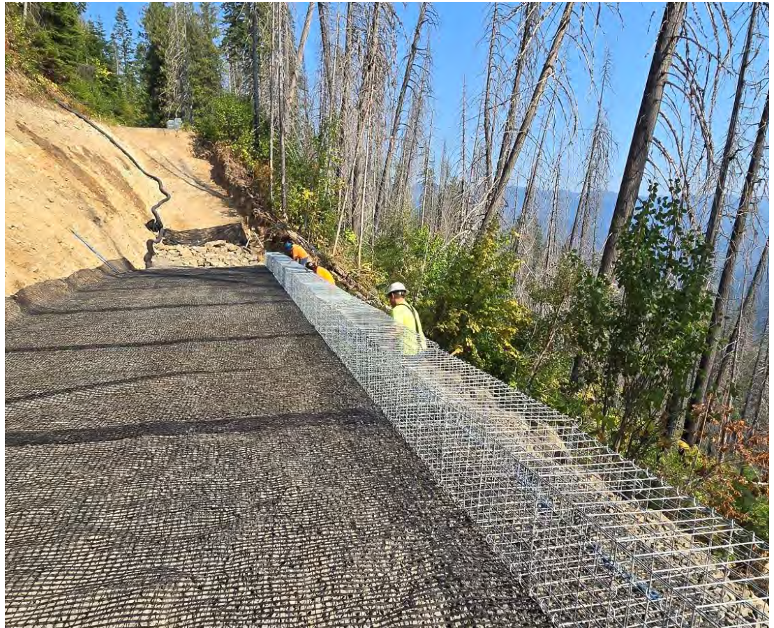
RSS wall construction M.P. 2.52 FSR 470

FSR470, Swiftwater Road, remains closed to thru traffic from the Selway River to the junction of FSR653. At M.P. 2.52 of FSR470, Structural excavation is taking place and the road is not passable to any vehicles including emergency vehicles. FSR470 will remain closed to all thru traffic through at least the end of September.