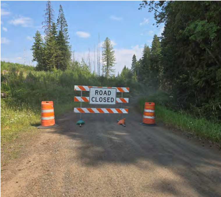
Road Closed sign, Junction FSR470 and FSR653