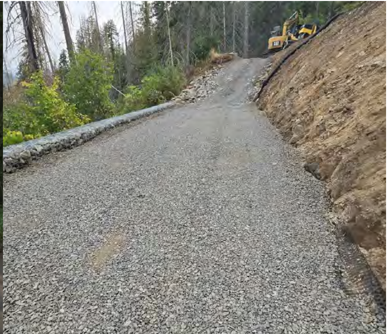
RSS wall construction, M.P. 2.52 FSR 470