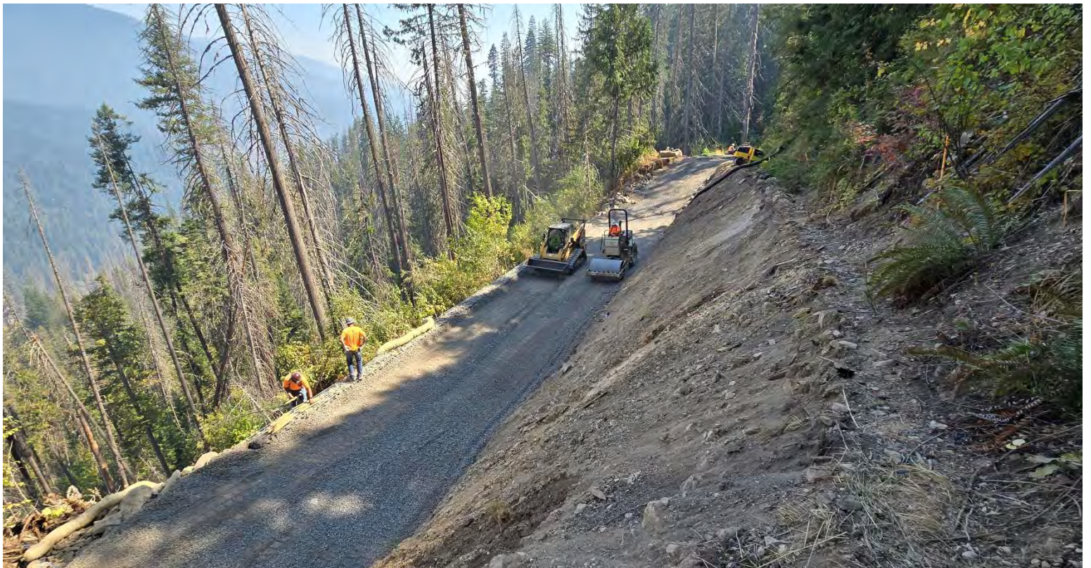
RSS wall construction, M.P. 2.52 FSR 470