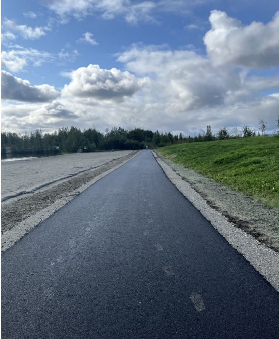
Bottom Left: Lathrop St. Bottom Right: Shared Use Trail.

Website: Tanana River Recreation Access | FHWA (dot.gov)