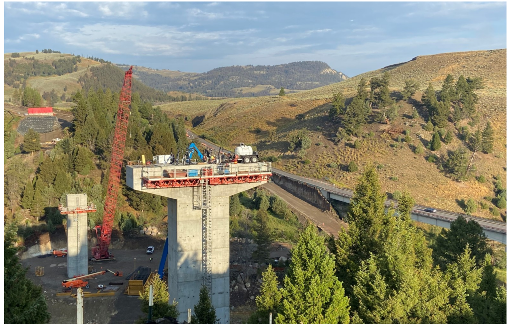
Overview of the Project Site