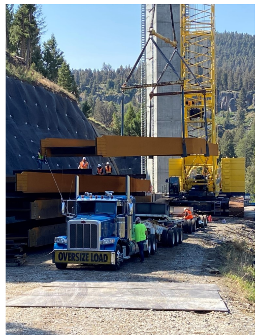
Pier 3 Girder Delivery