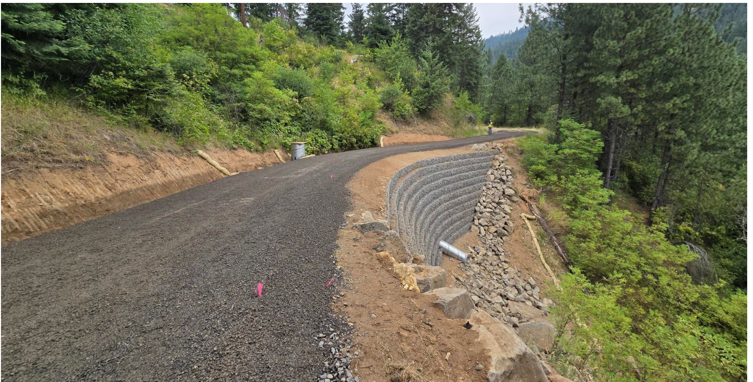
Completed Gabion face wall and roadway FSR 5503 M.P. 1.28