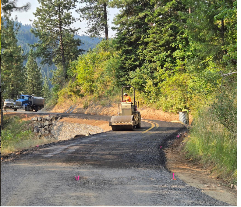
Riser Inlet installation, FSR5503