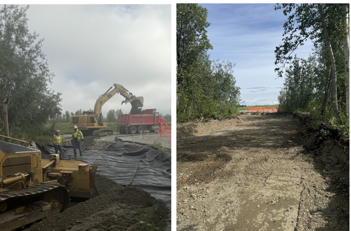
Left: Trail construction with geo fabric.