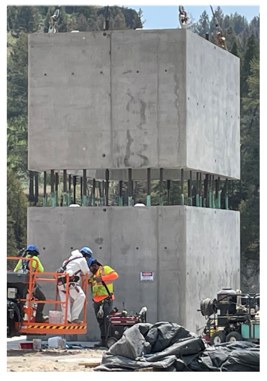
Placement of Pier 2 segment

Daytime picture of concrete pour with Yellowstone River, the new construction and the old bridge