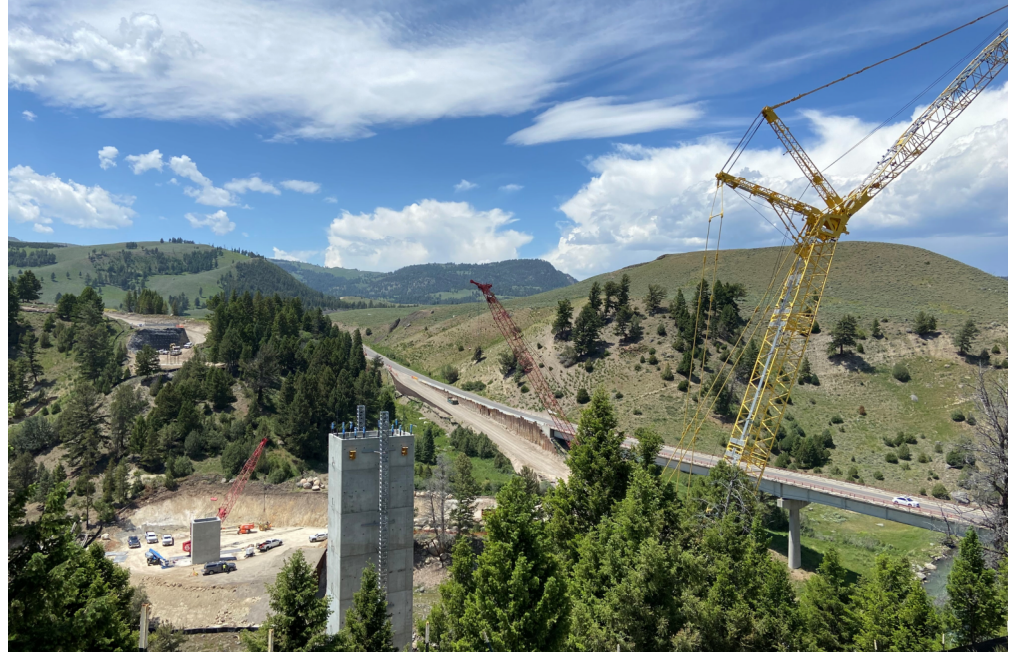
Completed Pier 3 and Start of Pier 2