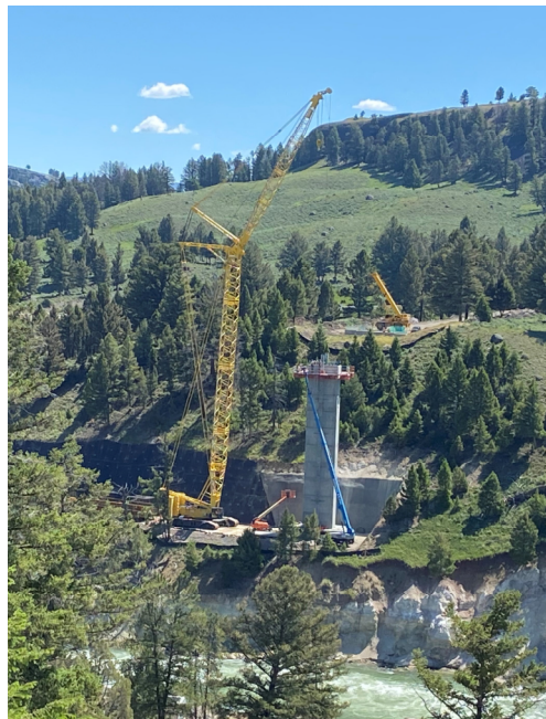
Completed Pier 3