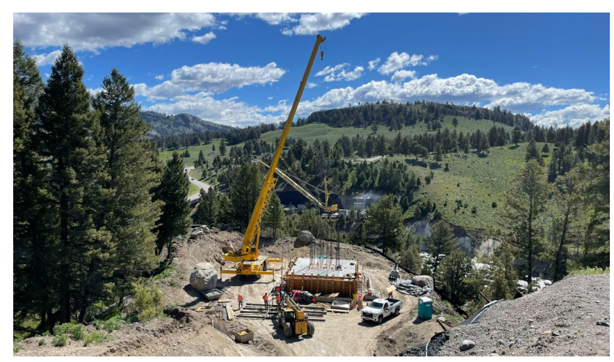
Pier One Forms Being Stripped