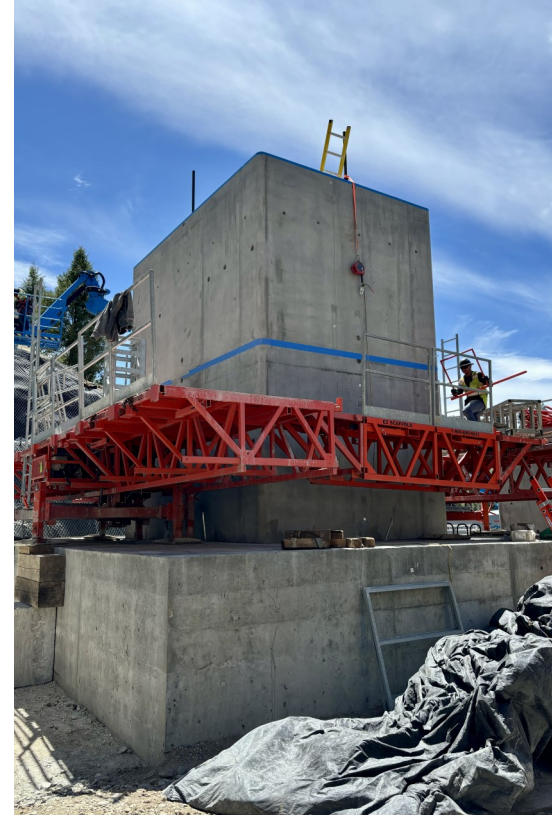
Pier Three with Two Segments Stacked