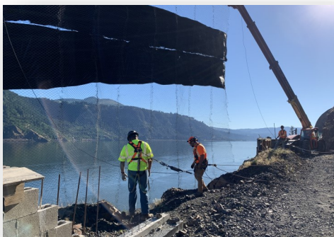
Rock Containment Net Placement at West Bench