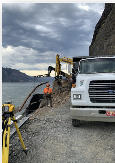
Rock Scaling on West Bench Slopes