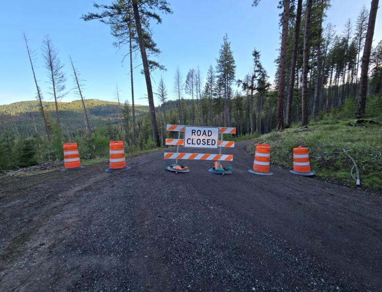
Road Closure M.P. 15.7 FSR354