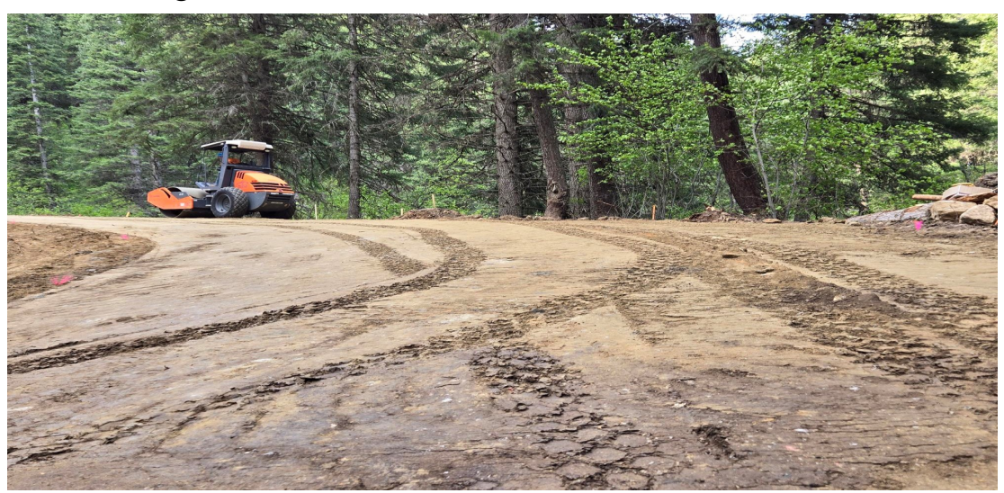
Turnout construction, subgrade prep, M.P. 13.6, FSR354

FSR 354 will be closed to the public while construction operations are completed through out the month. The road closure is intended to stay in place during weekends which will include the Memorial Day Holiday from the bridge at the intersection of Main Slate Creek Rd (FSR 354) and Little Slate Creek Road (M.P. 12.8 to M.P. 15.9). Slate Creek road towards Nutt Basin will remain open. No traffic delays are anticipated however, there will be heavy truck traffic, typically in the mornings and afternoons as the Contractor arrives to the project location and leaves at night.