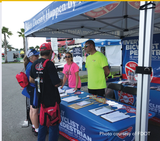
Participants fill out surveys and/or pledges to receive a pedestrian and bicycle safety bag of educational information.

To develop and implement effective and sustainable solutions to improve pedestrian and bicycle safety in Florida, the Florida Department of Transportation (FDOT) developed Florida’s Bicycle/Pedestrian Focused Initiative in 2011 to lead all efforts to improve pedestrian and bicycle safety in the state. The campaign was branded “Alert Today Florida” in 2012. In 2013, FDOT developed Florida’s Pedestrian and Bicycle Strategic Safety Plan (PBSSP) and formed the Florida Pedestrian and Bicycle Safety Coalition to vigorously implement the plan. Alert Today Florida adopted a data-driven approach to use available resources to achieve the most tangible results, focusing on engineering, education, enforcement, and emergency medical services, while prioritizing areas with the highest representation of traffic crashes resulting in serious and fatal injuries to pedestrians and bicyclists.