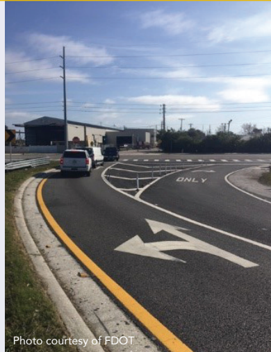
I-275 NB Off Ramp and SB On Ramp at 31st St

The innovative DBPB contractual approach addressed the inherent inefficiencies of the typical contractual process for these traffic safety improvement projects by combining the efficiencies of design-build contracts (in which designer is working in close coordination with the construction team) with the time savings of push-button contracts (in which pre-selected push-button contractor is able to quickly get to work since all of the contractual paperwork is already in place). In the design-build scenario, the designer and the construction contractor are working together on the same team, so there are no misunderstandings about the what and the how of the project. The project also gets built faster, as construction activities can begin while some parts of the plan are still being finalized. In the