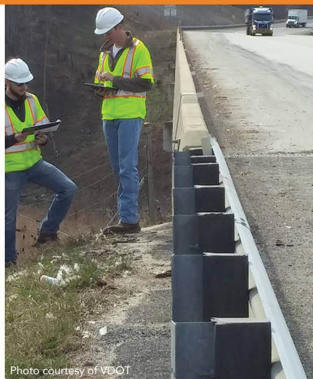
Guardrail teams assess a high priority guardrail using the VDOT Guardrail Tracker

To meet these challenges, in 2016, VDOT established a new data- and risk-based strategic guardrail management program and leveraged data and technology to drive institutional changes in policy, inventory, process, and supporting management tools. For instance, leveraging technology, VDOT collected a complete statewide guardrail terminal inventory with detailed manufacturer and product information within a few months and at a nominal cost. A new Guardrail