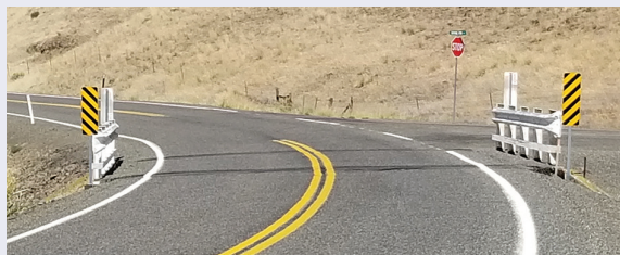
Full striping (centerline and fog lines), system wide sign evaluation and upgrades, delineators, vertical panels, guardrail, roadside hazard mitigation, alignment correction, sight distance improvements.

improvements, and develop a process for prioritizing investments.