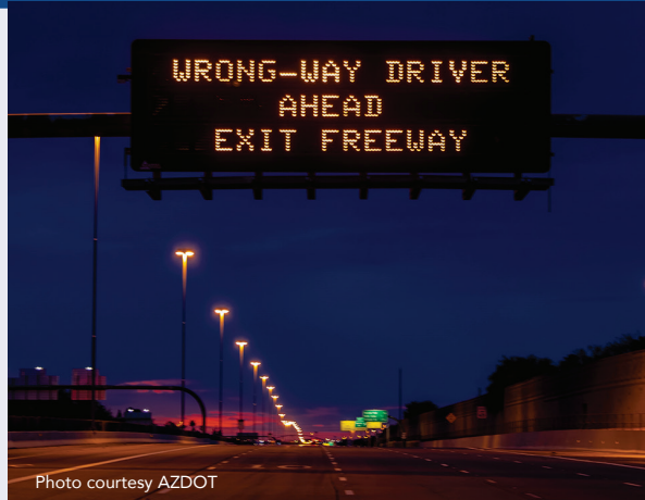
Wrong-Way Pilot DMS Display to Right-Way Drivers

Installed along a 15-mile stretch of I-17 in central Phoenix, the $4 million system consists of 90 FLIR thermal cameras positioned throughout the corridor to detect wrong-way vehicles, illuminated "WRONG WAY" signs for enhanced notification to the wrong-way driver, geofenced alerts of incoming danger to right-way drivers through overhead boards and the ADOT Alerts