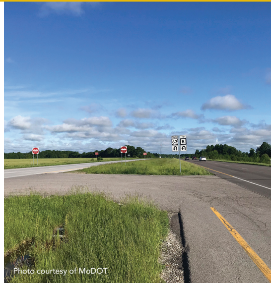
Median U-turn in Clark (intersection of US 63 and Routes B/P)

Median U-Turn intersections eliminate side road crossing and side road left turn movements at intersections on four-lane expressways. The intersections require side road traffic to turn right, merge into oncoming traffic, then merge to a median deceleration and U-turn movement to cross or make what