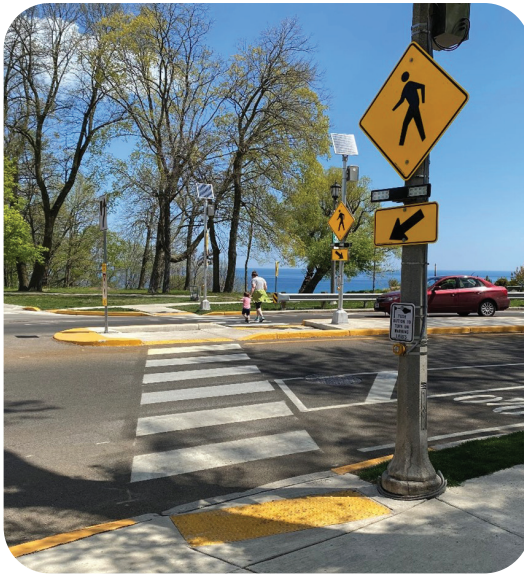
"Danish Offset" crossing at a curve on Lake Drive at Palisades Road.

Longer-term design solutions were intended to solidify the safety improvements, and many were financed through federal aid assistance via the Highway Safety Improvement Program and designed by the Wisconsin Department of Transportation. Innovative improvements included a "Danish Offset" pedestrian crossing (first deployed in Denmark, the path of the crossing is offset to enable pedestrians to more directly observe oncoming vehicles), high-friction