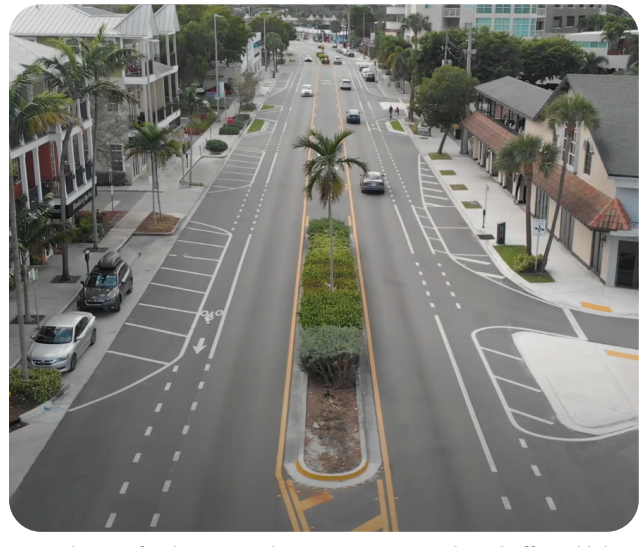
Aerial view of Wilton Drive showing on-street parking, buff-ered bike lanes, median separation, and pedestrian facilities.

Along The Drive, the MPO worked together with the cities of Wilton Manors and Fort Lauderdale and the Florida Department of Transportation (FDOT) to develop the Wilton Drive Complete Streets project. Prior to the redesign, The Drive included four 12-foot vehicular travel lanes with turn lanes in the painted median, which encouraged higher speeds and negatively affected safety. The Complete Streets effort included the elimination of one vehicular travel