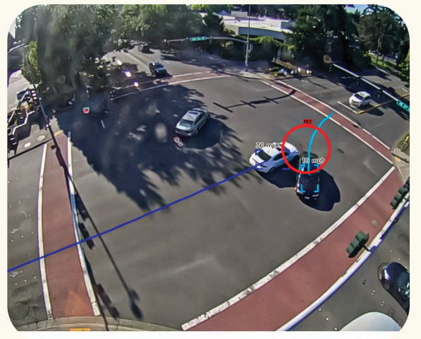
Vehicle-vehicle traffic conflict at NE 8th Street and 156th Avenue NE.

The City of Bellevue, WA, a Vision Zero community, was an early adopter of these proactive safety techniques, forging multiple technology development partnerships to convert raw video footage from its existing traffic camera network into flow, speed, and conflict event data. In addition to identifying conflict hot spots – often in one week of data collection versus many years of crash report documentation – video analytics