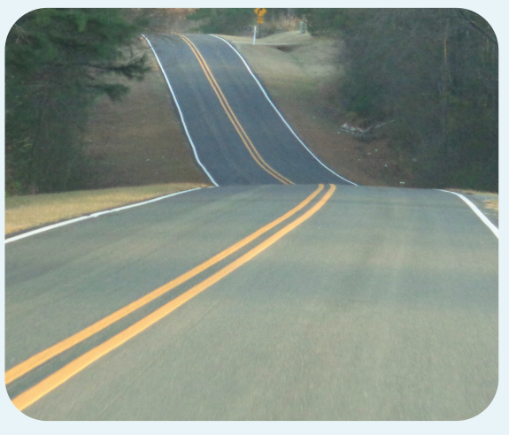
An application of long-life double centerline markings on North Carolina State Route 1131. Photo courtesy NCDOT.

All types of long-life markings demonstrated crash reductions: Across all sites treated with the countermeasure (over 400 miles of roadway), NCDOT found a statistically significant 13 percent reduction in lane departure crashes. The best safety results, however, were seen with wider, 6-inch markings with standard beads, which