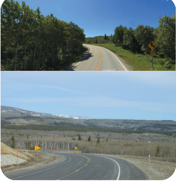
Old (top) vs. new (bottom) alignment.

The project implemented many innovative engineering concepts including snow storage design, geotechnical slope stabilization and armoring, and strategically located vehicle pullouts to accommodate motorists wishing to pullover to observe the natural landscapes, vistas, and cultural sites. Motorcycle enthusiasts specifically requested the perpetuation of a curvilinear alignment to maintain riding pleasure, which was achieved while still providing curves that are much safer, meet full design standards, and accommodate the RVs and other large vehicles that also use the corridor. Moreover, existing shoulder widths were zero