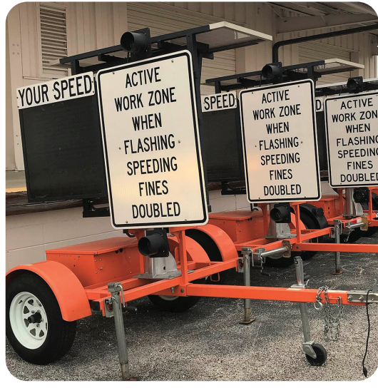
AWAD installed on portable trailers ready for deployment to work zones.

This innovative project sought successful engineering solutions to effectively address the major problems of speeding and unsafe behaviors in arterial work zones. FDOT and CUTR worked closely to plan, coordinate, implement, and evaluate proposed smart work zone applications under many test scenarios at six study sites. The technologies studied included the Active Work Zone Awareness Device (AWAD) and two iCone products. The AWAD is a relatively low-cost countermeasure that consists of a radar device with LED signs mounted on a trailer that warns approaching drivers of an active work zone,