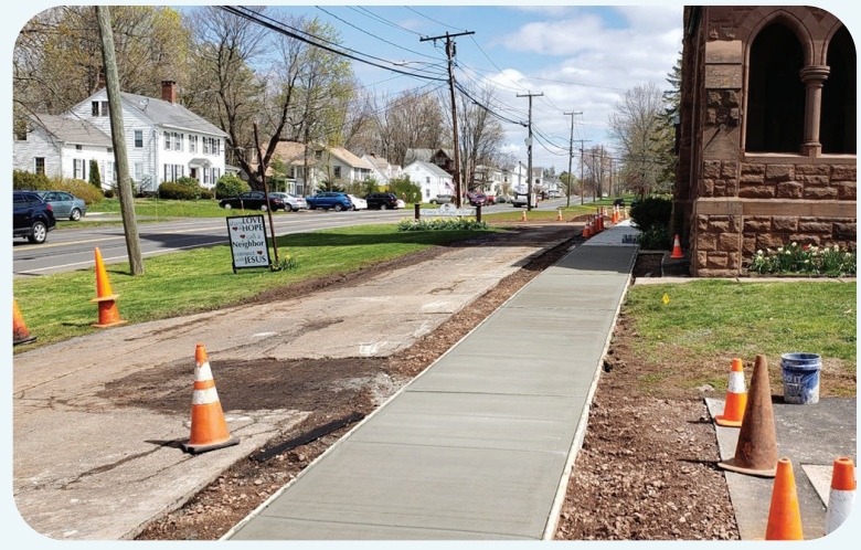
Sidewalks installed on Main Street.

ocated in central Connecticut and responsible for 63 miles of roadway, the Town of Portland is a small community of under 10,000 residents that faced serious safety concerns regarding vehicle speeds and limited opportunities for safe