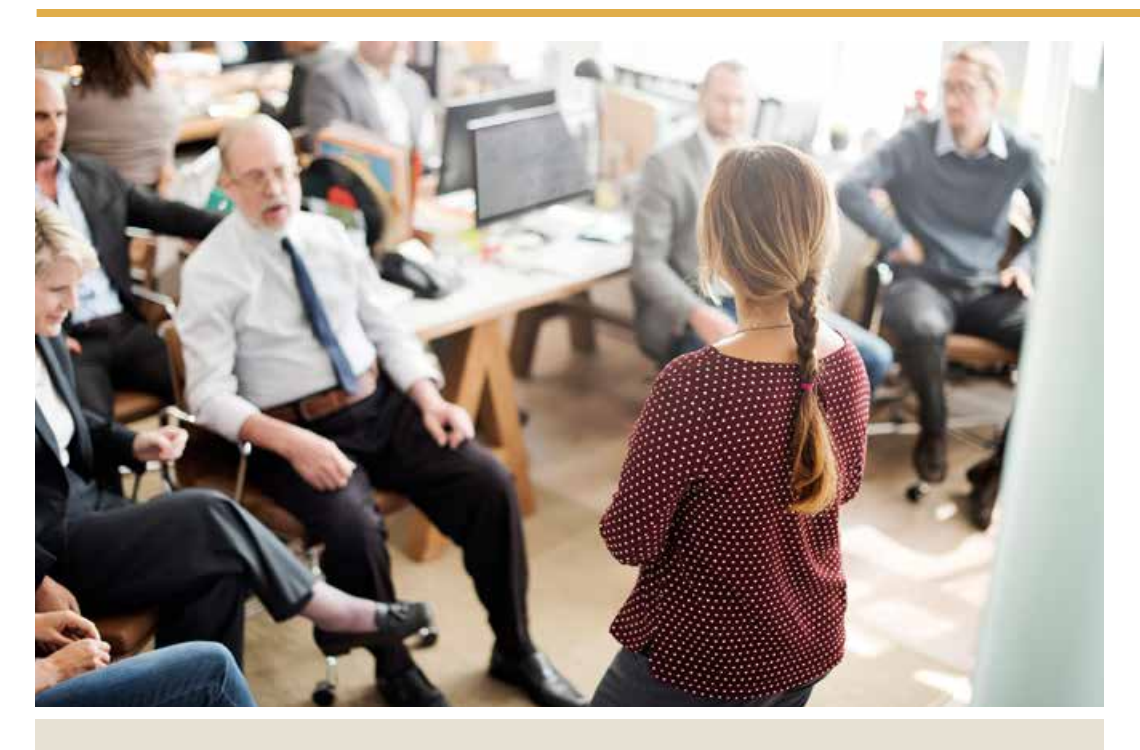
Leaders bring people together, provide essential direction, and motivate people.