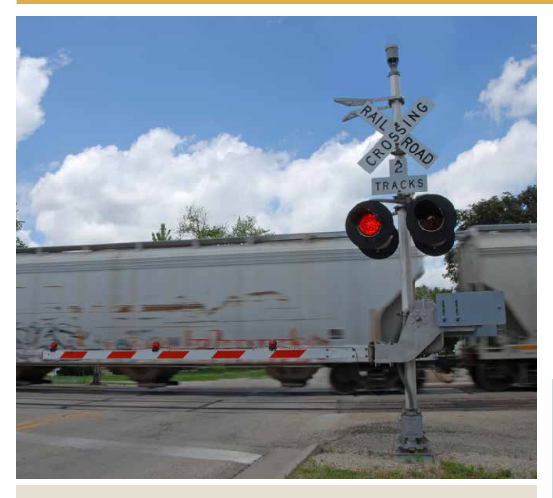
The Railway-Highway Crossings Program funds safety improvements at crossings.

wayside horns, and signal improvements such as railway-highway signal interconnection and pre-emption.<sup>20</sup>