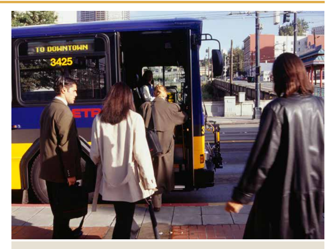
The Federal Transit Administration seeks to improve public transportation, such as buses.

"MAP-21 Programs," accessed October 16, 2013, https://www.transit.dot.gov/regulations-and-guidance/legislation/map-21/map-21-programfact-sheets.