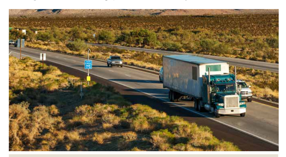
The Federal Motor Carrier Safety Administration develops, monitors, and ensures compliance with commercial driving licensing standards.

"Key FMCSA Programs," accessed October 15, 2013, https:// www.fmcsa.dot.gov/ mission/we-arefmcsa-brochure.