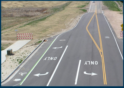
Left- and right-turn lanes on a two-lane road.

For more information on this and other FHWA Proven Safety Countermeasures, please visit https://safety.fhwa.dot.gov/provencountermeasures/ and https://www.fhwa.dot.gov/publications/research/safety/02103/02103techbrief.pdf.