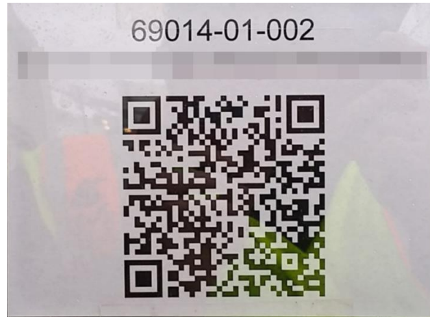
Figure 6. Image. 2D data matrix barcode.

There are two primary types of barcodes: 1D and 2D. The most common type is a 1D barcode, which consists of parallel lines and spaces (see figure 5). The 2D barcodes consist of a combination of dots and geometric shapes or a matrix (see figure 6). More than 44 different barcode formats (various ways to present the lines, spaces, and dots) are commercially available.