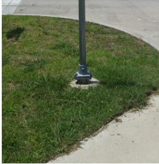
Figure 4. Photo. Example of breakaway hardware.