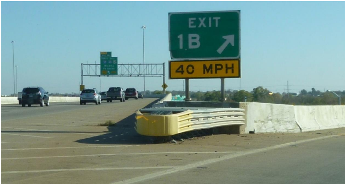
Figure 3. Photo. Example of a crash cushion.

Figure 3 shows an example of a crash cushion.