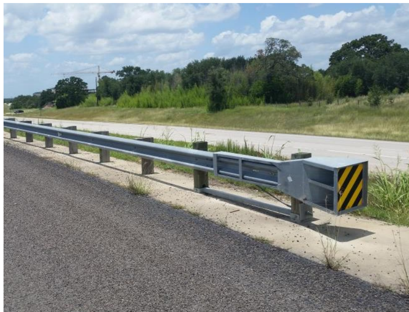
Figure 2. Photo. Example of a barrier terminal.

Figure 2 shows an example of a barrier terminal.