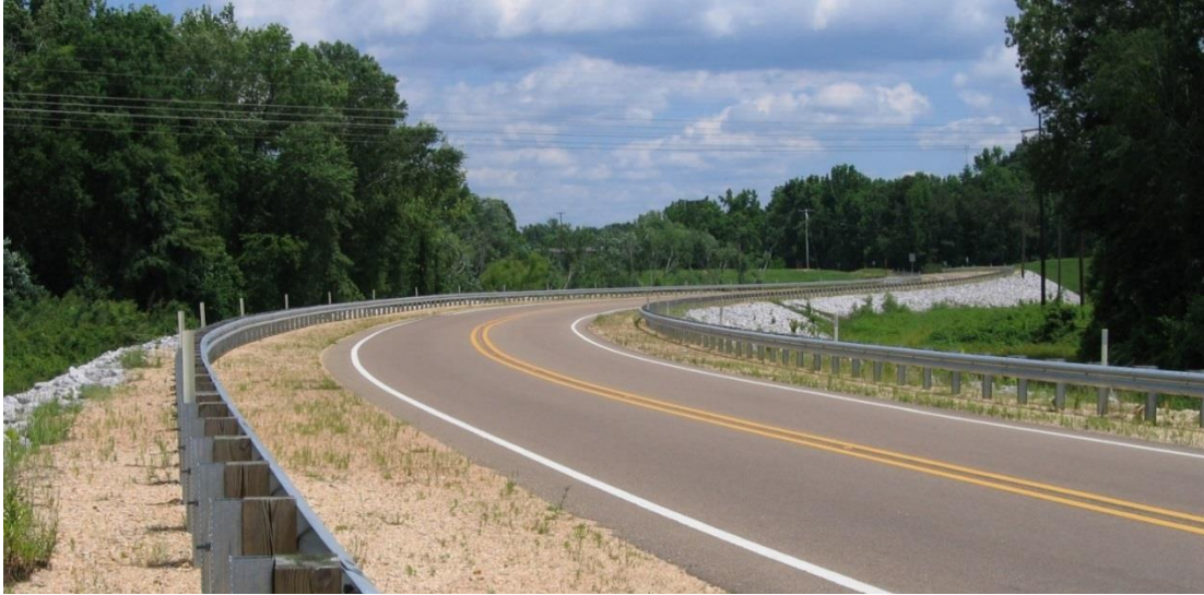
Figure 1. Photo. Example of longitudinal barrier.