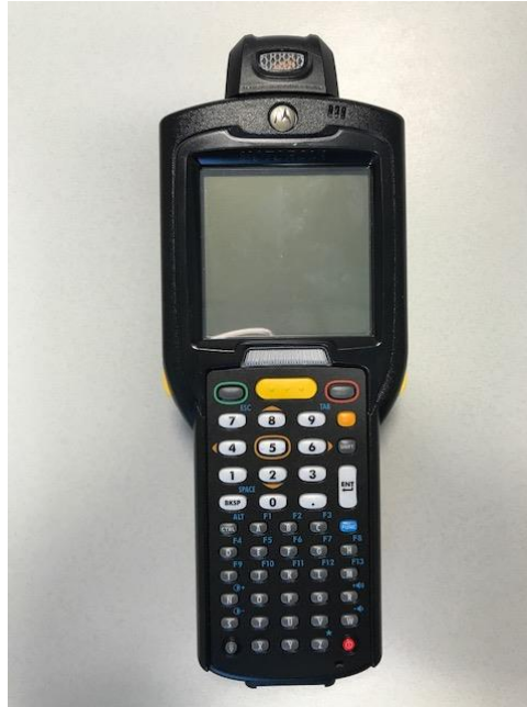
Figure 7. Photo. Barcode scanner.