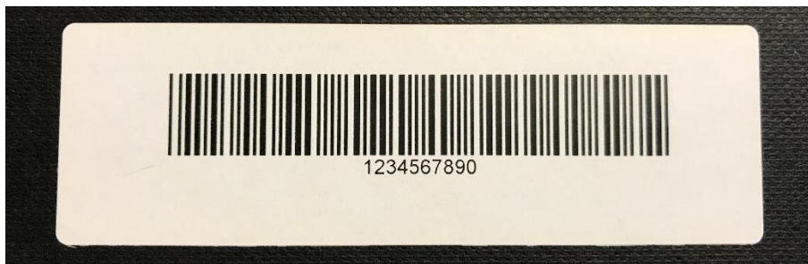
Figure 5. Image. Combination barcode and serial number tag.

In considering barcodes and serial numbers, the construction of the tag is very similar, and often manufacturers print both barcodes and corresponding serial numbers along with any additional information a buyer might want on the tag (see figure 5). Barcode standards are provided by the GS1 system established by the Uniform Product Code Council, which has been in place since 2005.