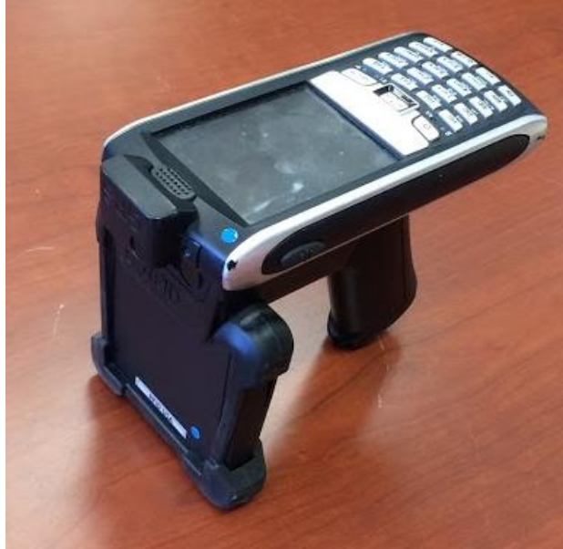
Figure 9. Photo. Handheld RFID reader.