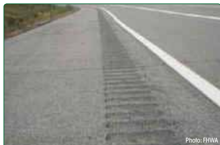
FIGURE 2. Shoulder Rumble Strips

which have an added benefit of improving the visibility of the marking in wet, dark conditions. Center line rumble strips have been shown to reduce head-on and opposite-direction fatal and injury crashes by 45 percent on rural two-lane roads. 4