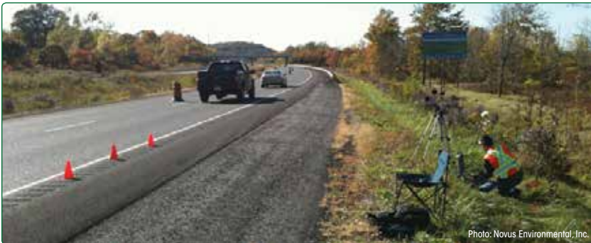
FIGURE 3. Field Noise Measurements

Transportation agencies use sound-level meters to assess and record noise levels at field locations, as shown in Figure 3. The sound level of rumble strips can be difficult to measure as it occurs more intermittently than normal highway noises. The same basic measurements used to measure highway traffic noise are also used to measure rumble strip noise. The maximum noise level is typically the key consideration for rumble strips, whereas the average noise level, over a period of time, is the key consideration for highway noise. There is currently no method that adequately measures the unique character of rumble strip noise.