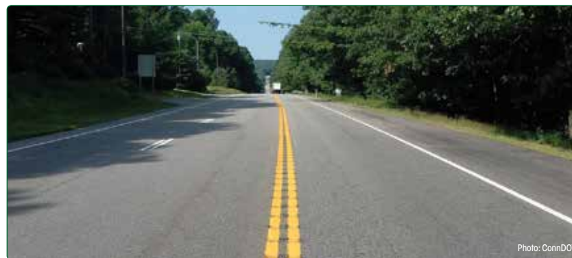
FIGURE 1. Center Line Rumble Strips