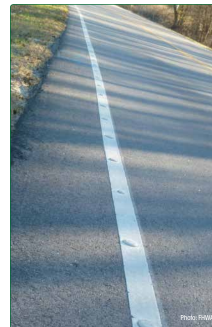
FIGURE 6. Raised Edge Line Rumble Strip

Several agencies have used modified rumble strip designs in an attempt to reduce noise levels. Some designs, like raised edge line rumble strips (shown in Figure 6), reduce external noise but do not provide the same level of internal noise and vibration as typical milled rumble strips. Currently, agencies are investigating rumble strip designs that provide sufficient alerting internal noise, while reducing external noise, as described below.