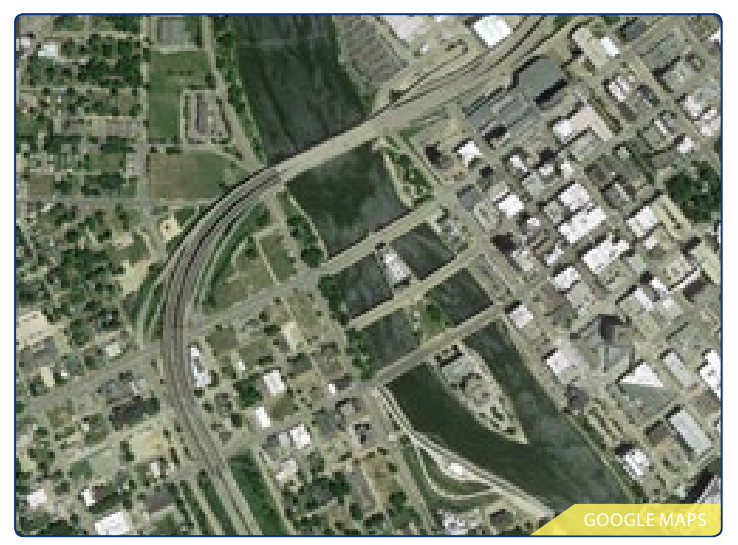
Figure 1. 5-in-1 Cedar Rapids Bridge

lowa Department of Transportation (IDOT) chose to install their introductory HFST application on a bridge over the Cedar River. The 5-in-1 structure comprises four bridges: north and southbound I-380, eastbound "A" Avenue, westbound "F" Avenue, and a dam. Located just west of the river, the curve is a part of the six-lane urban I-380 that runs through Cedar Rapids and carries approximately 85,000 vehicles per day. Several large corporations surround this area and ship supplies nationwide, contributing to the approximately 7,800 heavy trucks that use the bridge daily.