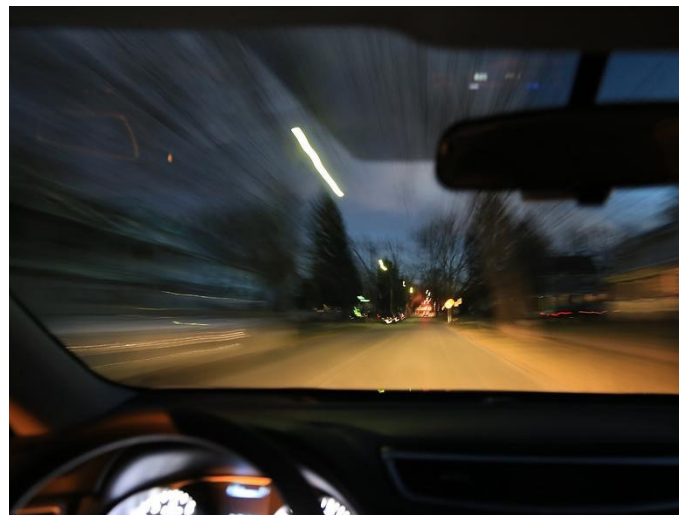
Interior of speeding vehicle.

Addressing speed limits on the HIN required consideration of the Texas Transportation Code which emphasizes an 85th percentile method be used for setting speed limits with allowances for other considerations, such as crash history and high driveway density. The city determined that these considerations should be applied to roadways on the HIN based on their urban settings and operations; therefore, the city will be using USLIMITS2 extensively to support setting new speed limits on collector and arterial roadways. This moment represents a paradigm shift in how the city approaches transportation planning, codifying in city policy the preservation of human life as the paramount priority for Austin's transportation network. Citizens are asking for their transportation network to be safe, accessible, and inclusive for all members of the community. The city is determined to achieve this by promoting a culture of safety education, focusing on behaviors that cause traffic injuries and fatalities, and through integrating safe design principles across their multimodal infrastructure 1 .