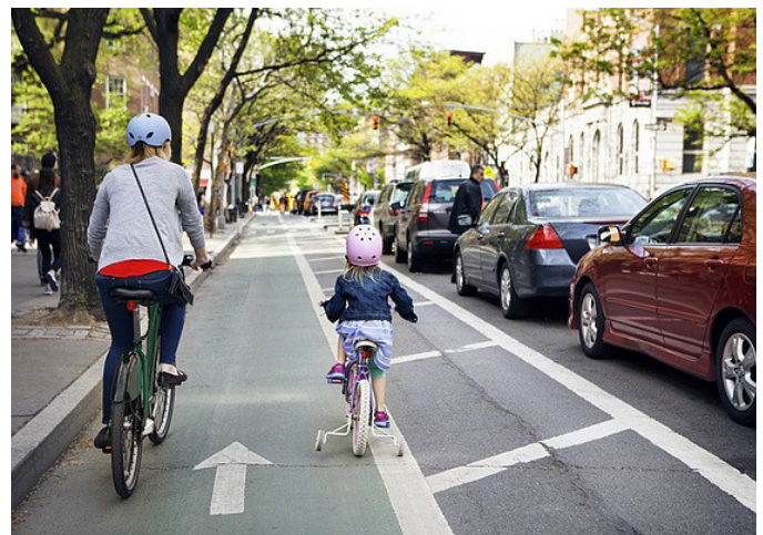
Adult and child riding in a bike lane.

Comprehensive approach – Another strategy for success was that in almost all of the cases, agencies also implemented other speed management countermeasures rather than just relying on changing the speed limit. In most cases, the speed limit reduction was part of their Vision Zero plan and was part of a multi-pronged approach to the problem. This helps make a case to the public that the changes are part of a larger plan to address safety.