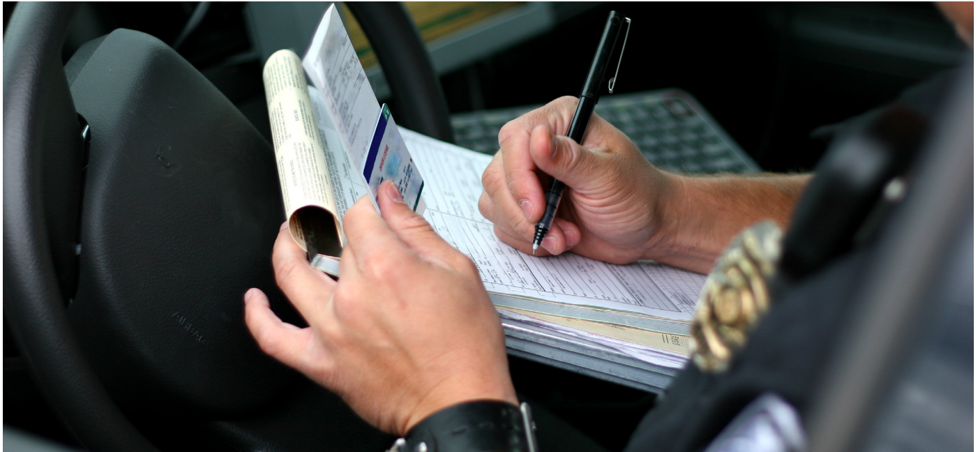
Officer uses driver information to complete a traffic ticket.