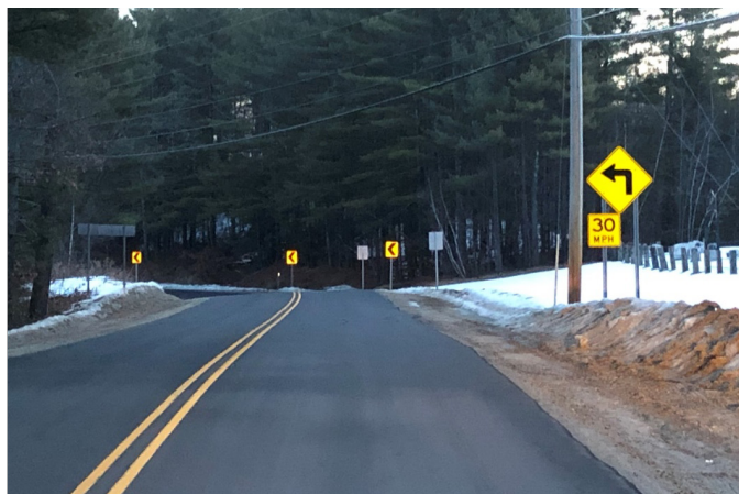
Curve warning signage in Wakefield, NH.