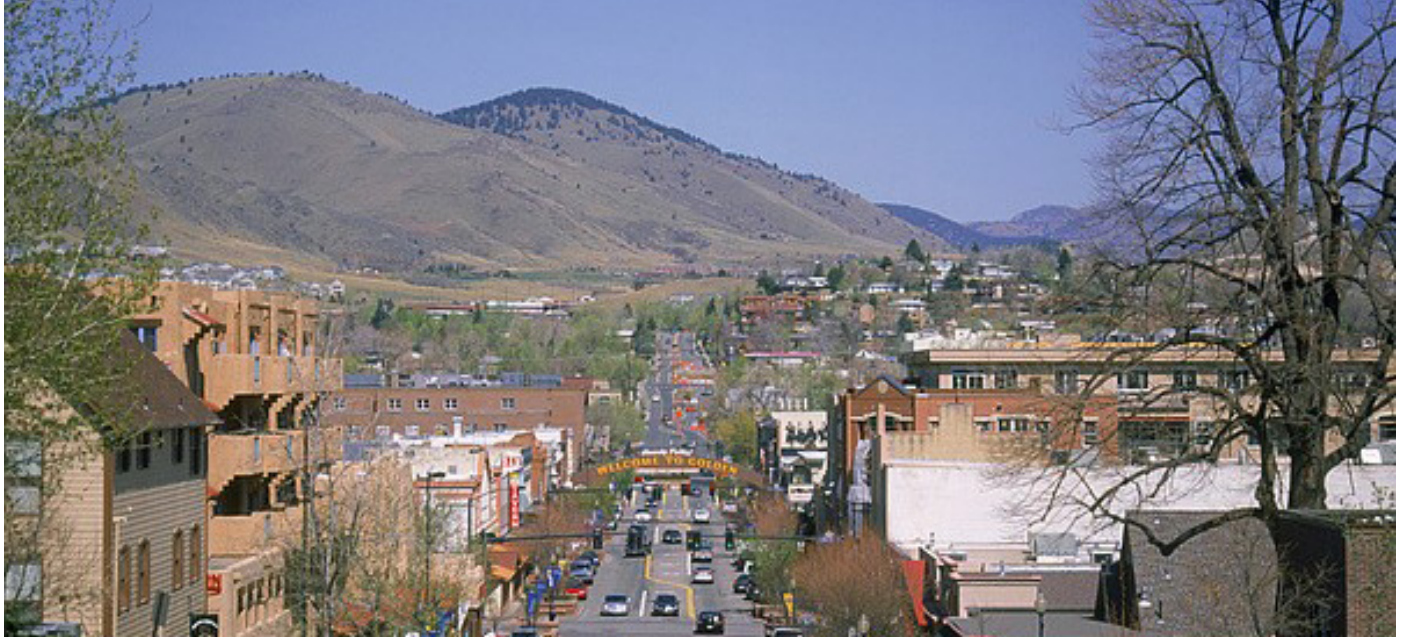
Golden, Colorado.