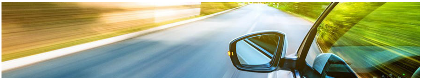
Speeding Vehicle.