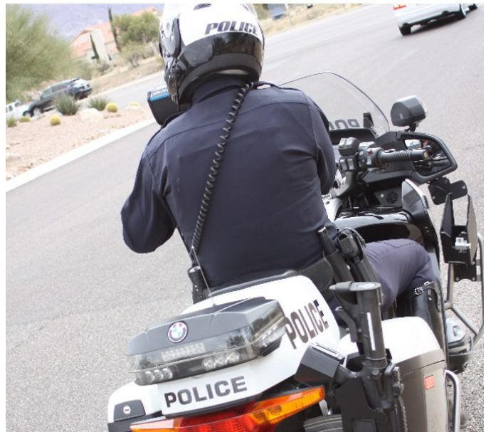
HiVE enforcement using motorcycles.