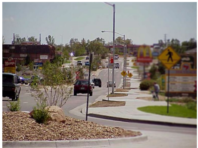
South Golden Road after improvements.