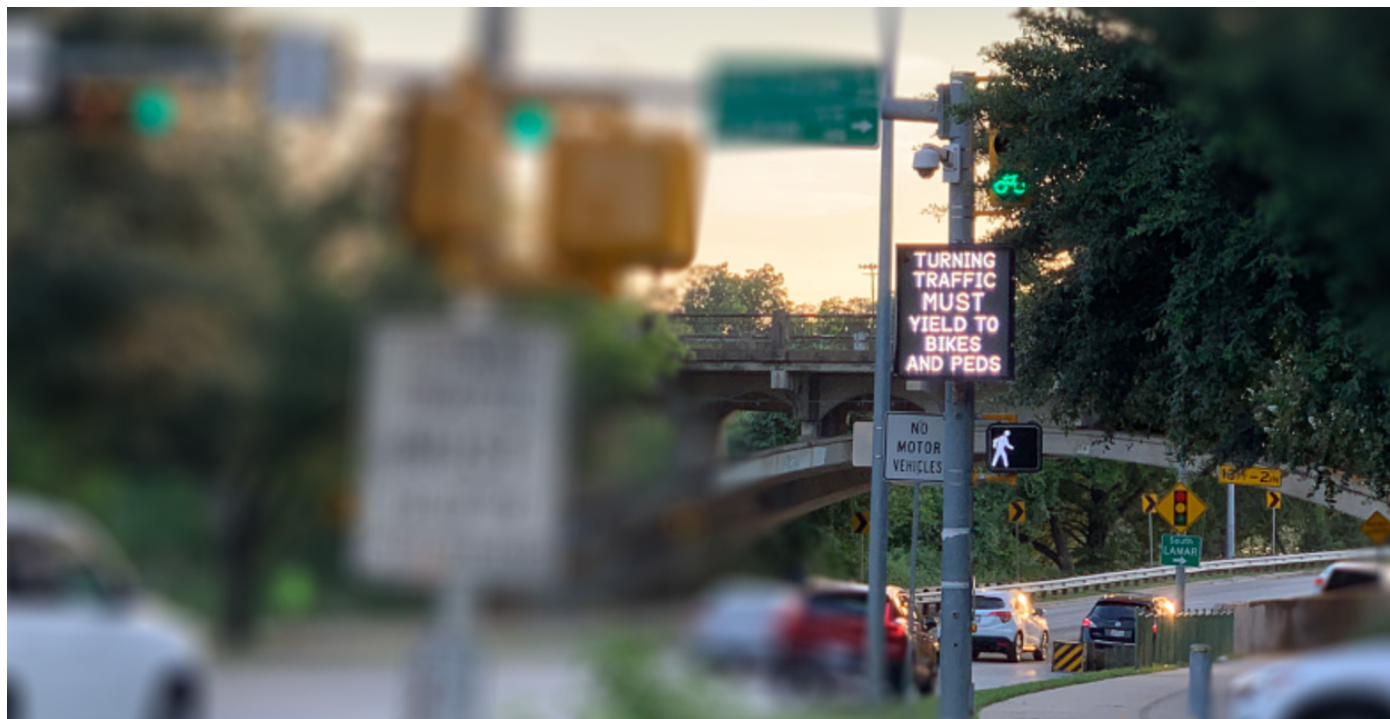
Austin's busy multimodal roadways.