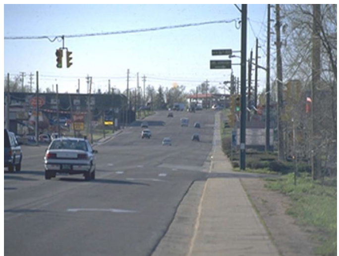
South Golden Road before improvements.

In response, the city rebuilt South Golden Road using design elements to address speeding, access, and overall safety. The self-enforcing design replaced traffic signals with roundabouts and addressed vulnerable road user safety 3 .