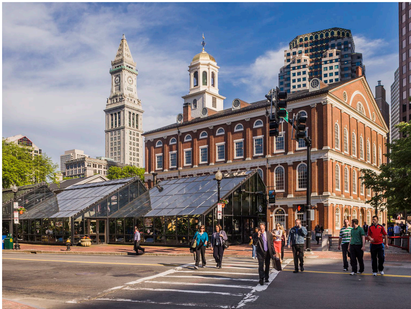
Pedestrians in Boston.