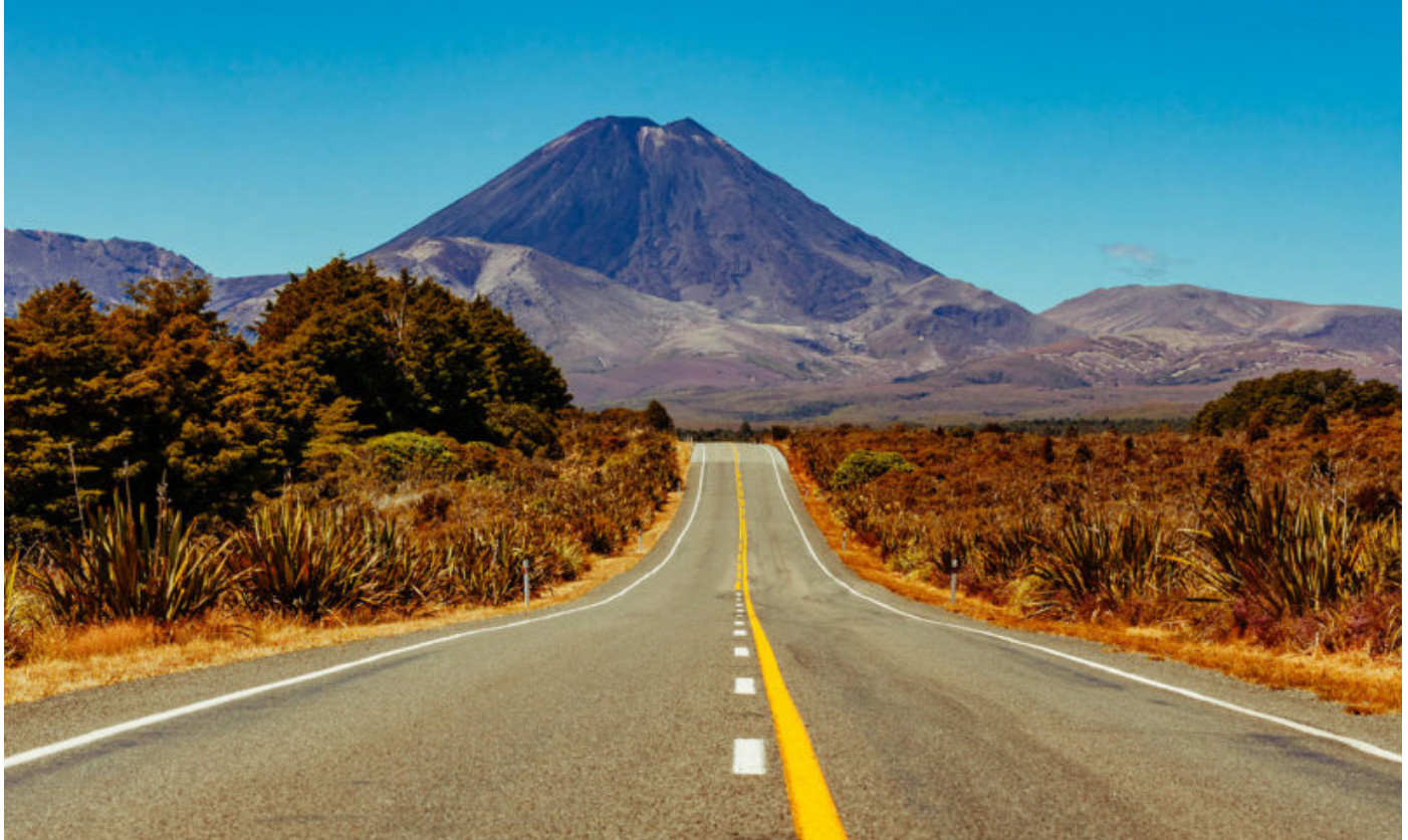
Typical rural road in New Zealand.

A measure of safety risk (low-to-high) is also assigned based on crash density and crash rate 6 . The IRR score is combined with safety risk and roadway function and a safe and appropriate speed recommended. The guide lays out principles for setting speed limits and applying speed