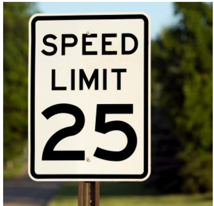
Speed Limit Sign

Several agencies have instituted consistent speed limits across a particular type of roadway as described in the following examples. The idea is to provide drivers with a consistent message. In most of the cases highlighted, speed limits were used to address vulnerable road users due to high pedestrian and bicyclist fatalities. As a result, the use of consistent speed limits across a jurisdiction usually resulted in lower speed limits. Although not highlighted in these noteworthy practices, the use of consistent speed limits can include redefining speed limit zone lengths and increasing speed limits along sections where a lower speed was not warranted.