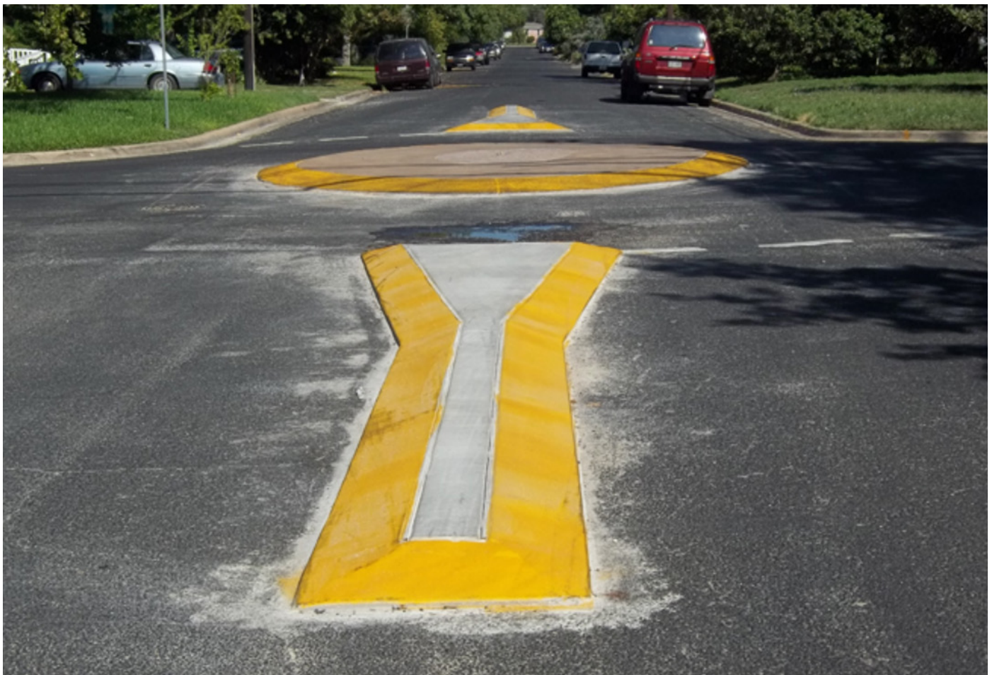
Images of several physical engineering countermeasures used are shown above: Rain Garden Bulb Out (top left), Median and Speed Cushions (top right), and Mountable Traffic Circles (bottom).