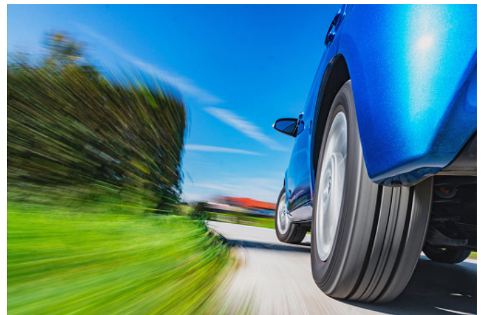
Speeding Vehicle.

While it is important to address these crashes, solutions should focus on the root cause of the crash when feasible. Countermeasures geared specifically towards speeding, such as Dynamic Speed Feedback Signs (DSFS), lane narrowing, or use of landscaping, may be less effective when the driver is impaired. Rather areas with a high number of impaired crashes should be targeted with countermeasures that address the impairment, such as enforcement.