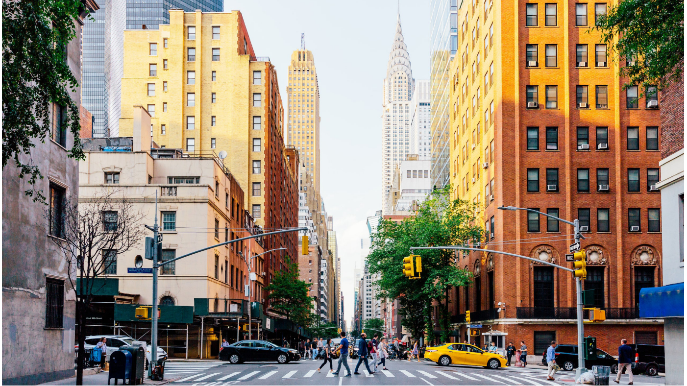
Pedestrians in NYC.