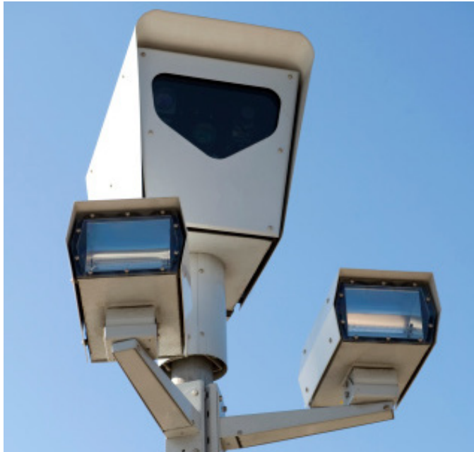
Safety Camera.