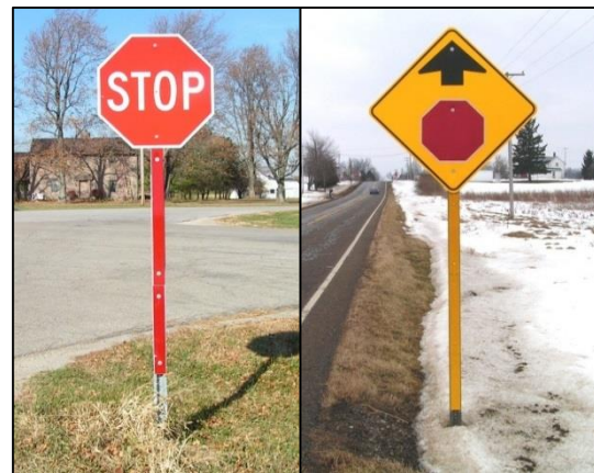
Sign post reflectors were one of the systemic countermeasures that the ISIP identified.