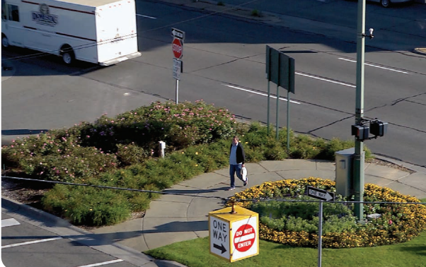
Pedestrian Crossing at an MUT Intersection, Birmingham, MI