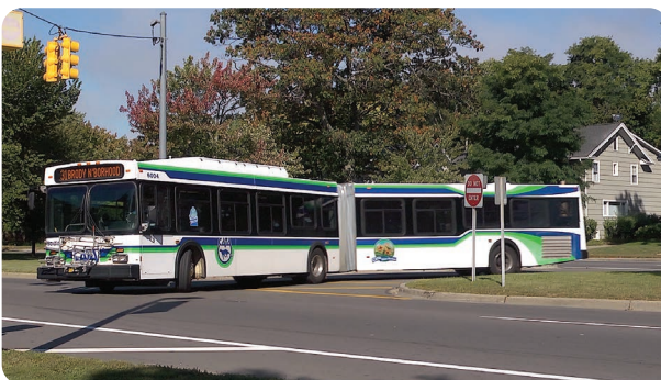
Bus Traveling an MUT Intersection, East Lansing, MI