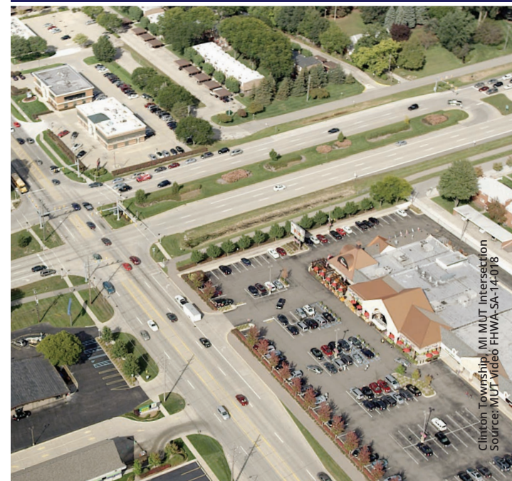
Clinton Township, MI MUT Intersection

AN INNOVATIVE, PROVEN SOLUTION FOR IMPROVING SAFETY AND MOBILITY AT INTERSECTIONS