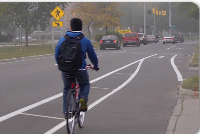
Cyclist Lane Near an MUT Intersection, East Lansing, MI

Greater efficiency also translates to fewer stops and less delay, making Median U-Turn corridors more reliable for transit and freight customers. And most importantly, the safety improvements mean emergency responders will spend less time responding to incidents at the intersection, even while they are able to travel through the intersection more easily.