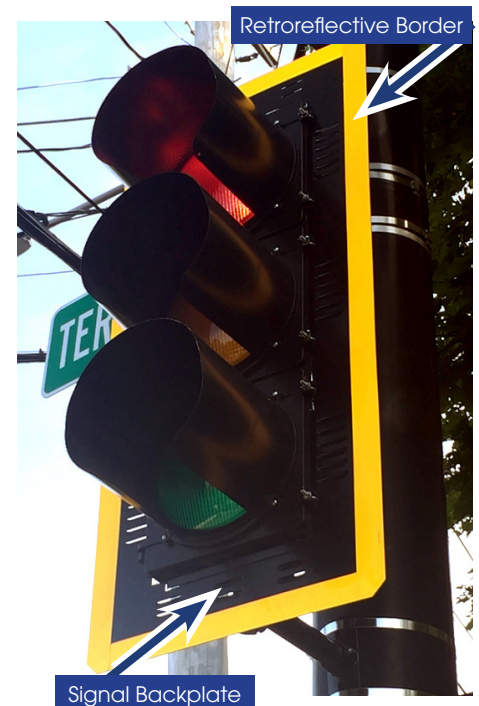
Signal backplate framed with a retroreflective border.

Transportation agencies should consider backplates with retroreflective borders as part of their efforts to systematically improve safety performance at signalized intersections. Adding a retroreflective border to an existing signal backplate is a very low-cost safety treatment. This can be done by either adding retroreflective tape to an existing backplate or purchasing a new backplate with a retroreflective border already incorporated. The most efficient means of implementing this proven