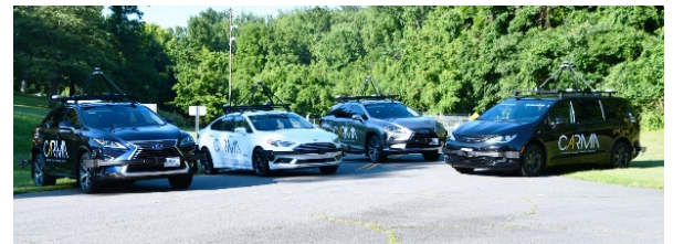
The CARMA SM fleet.