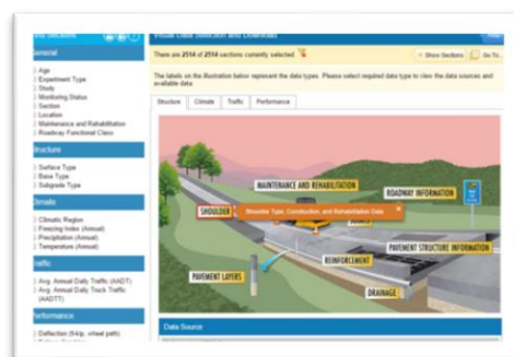
LTPP Web page

FHWA's Long-Term Pavement Performance (LTPP) InfoPave, which enables users to access pavement performance data and other information available through the LTPP program, has a new Web address: https://infopave.fhwa.dot.gov . The new URL fulfills the requirement that Government-owned Web portals have a .GOV address.