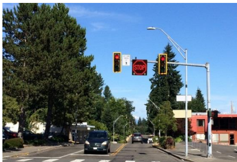
An example of a Cooperative Intersection Collision Avoidance System—Violation Driver Infrastructure Interface

FHWA's Office of Safety Research and Development (R&D) recently published a report that describes research offering initial design guidance for vehicle-to-infrastructure (V2I) safety messages and some limited guidance for vehicle-to-vehicle (V2V) systems.