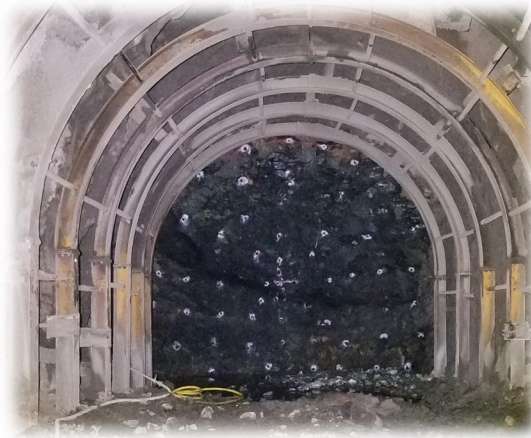
Below Right: West portal drilling