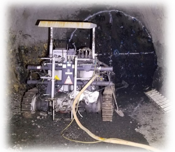
Below Left: West portal blast hole layout.

Left & Right: East portal face and drilling