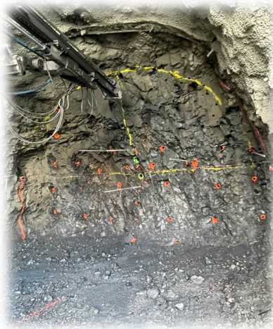
Left & Right: East Portal line drilling