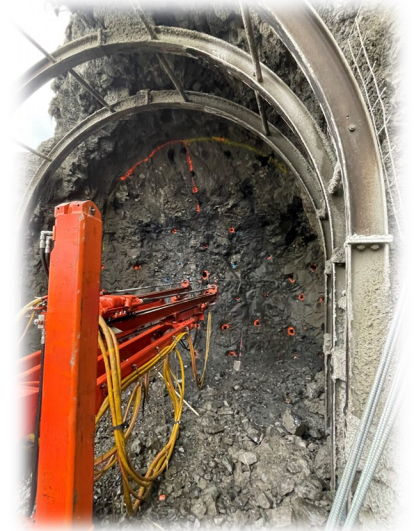
Right: West portal drilling