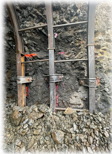
Left: Steel sets secured by mine straps