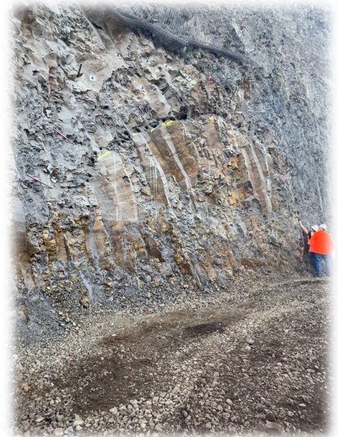
(All images) Source: FHWA