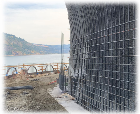
West bench outlook retaining wall excavation