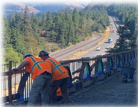
East bench picket form work