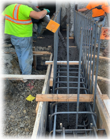
East portal wing wall foundation concrete pouring