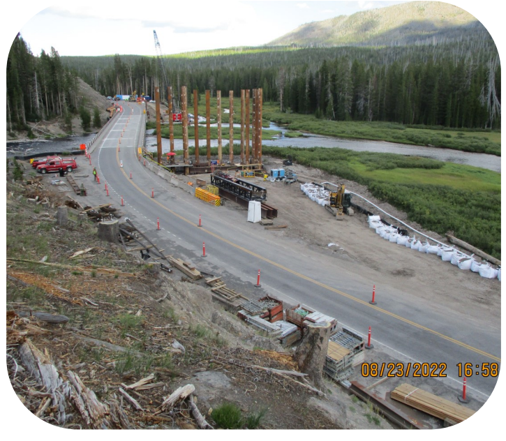
Temporary work bridge construction continues this week and into next week.