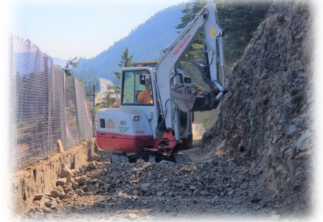
Right: Removal of rock to widen before drilling