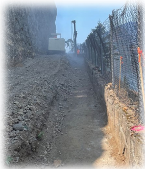
Left: Removal of aggregate and