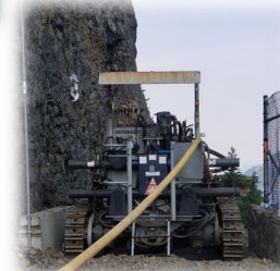
Right: On the East Side, post drilling the protection fence and grouting the posts