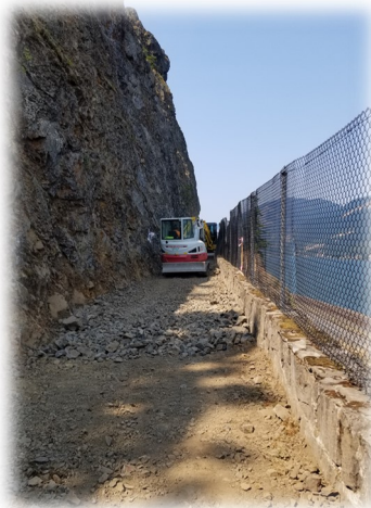
Left: Widening the access road for equipment