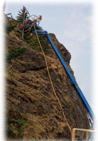
Right: Drilling the attenuator posts