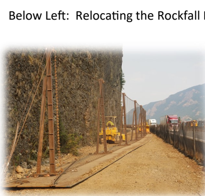
Below Left: Relocating the Rockfall Protection Barrier