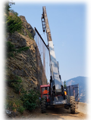
Right: Rock scaling on the East side