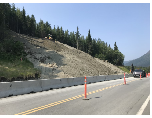
Dozer cutting slope at Sta 315+00.

Drennon is scheduled to work Monday through Saturday. Flagging operations will be required between the hours of 7:00am to 6:00pm, expect delays and one-lane traffic control. Be mindful of the haul trucks through the project corridor.