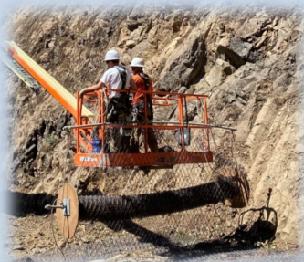
Left and Right: Mesh continues to be installed.