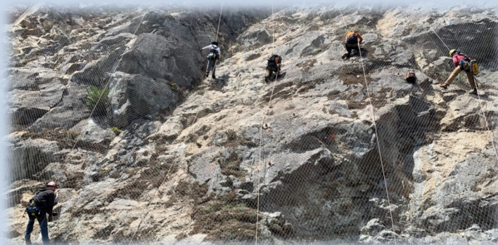
Above and Left:

Wire Mesh System continues to be installed.