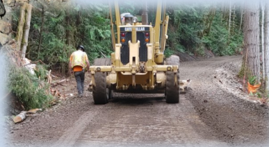
Below: Grading the Trail continues