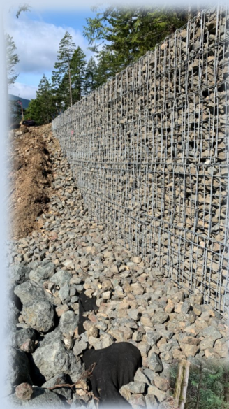
Left: MSE Wall completed