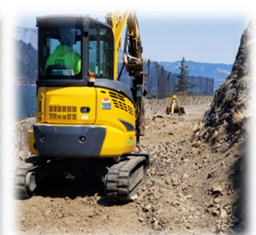
(All images) Source: FHWA