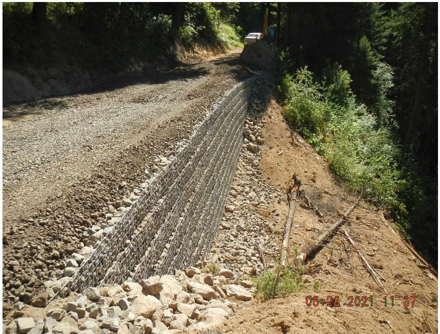
FSR 319 MP 1.6 MSE wall completed