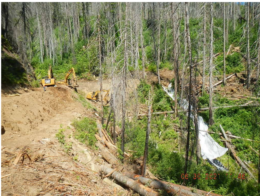
FSR 443 MP 28.76 Special Rock Embankment to be built. Diversion in place.