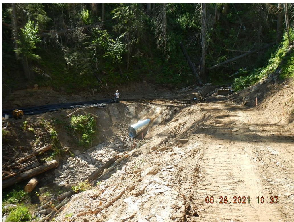
FSR 443 MP 28.83 New culvert pipe in place