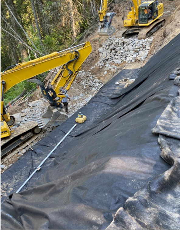
FSR 426 MP 2.7 Special Rock Embankment wall started