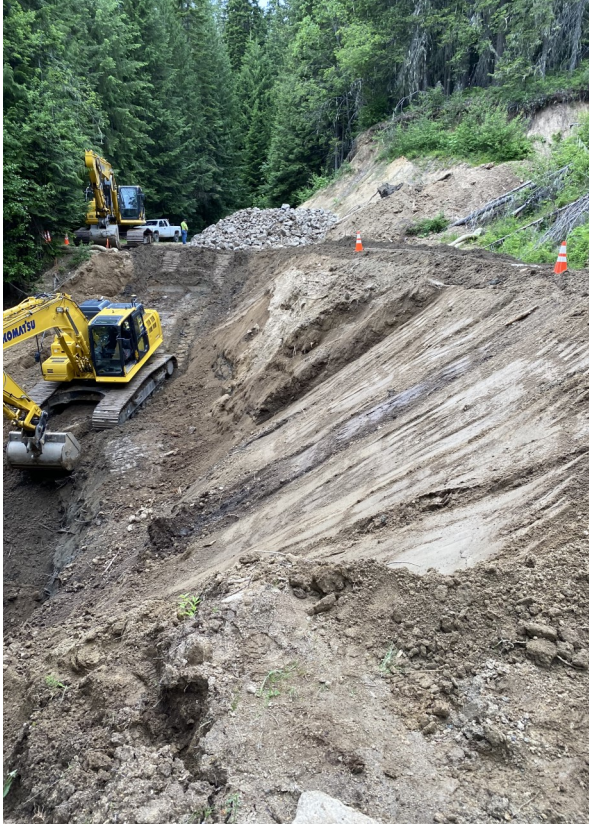
FSR 426 MP 0.5 ongoing excavation and stockpiling of rock for Special Rock Embankment wall