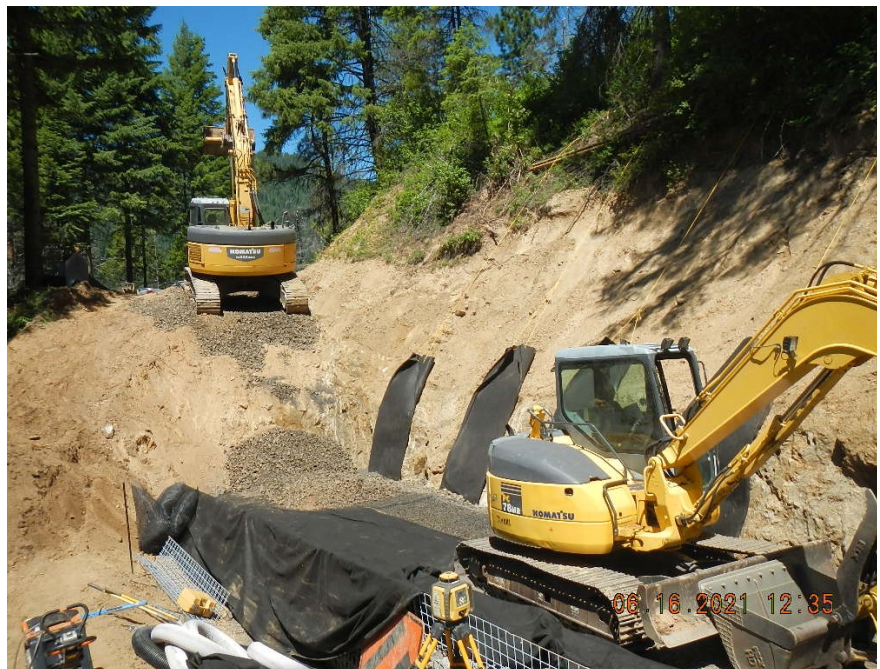
FSR 319 MP 1.6 MSE wall lifts begun