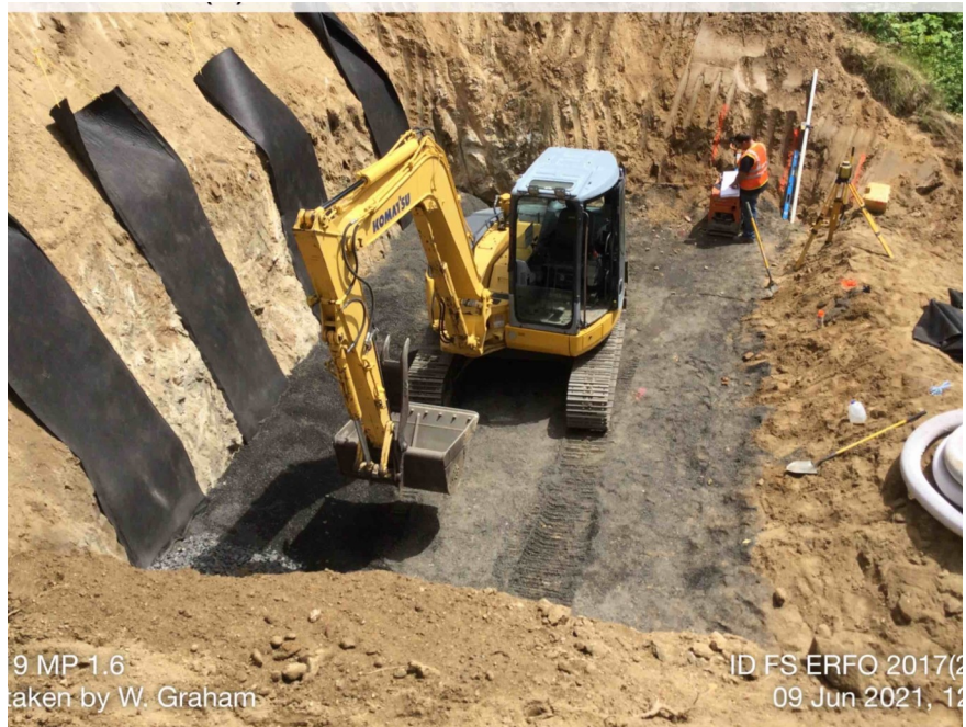
FSR 319 MP 1.6 beginning of drainage placement