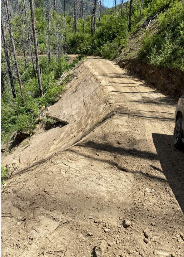
FSR 443 access road re- pair before MP 28