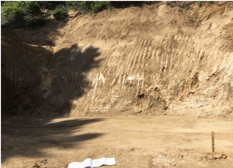
FSR 319 MP 1.6 excavation for MSE wall