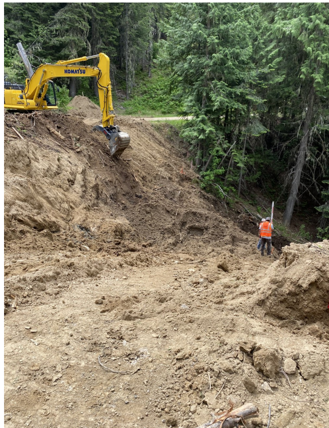
FSR 426 MP 0.5 Survey prep after clearing of area to be excavated