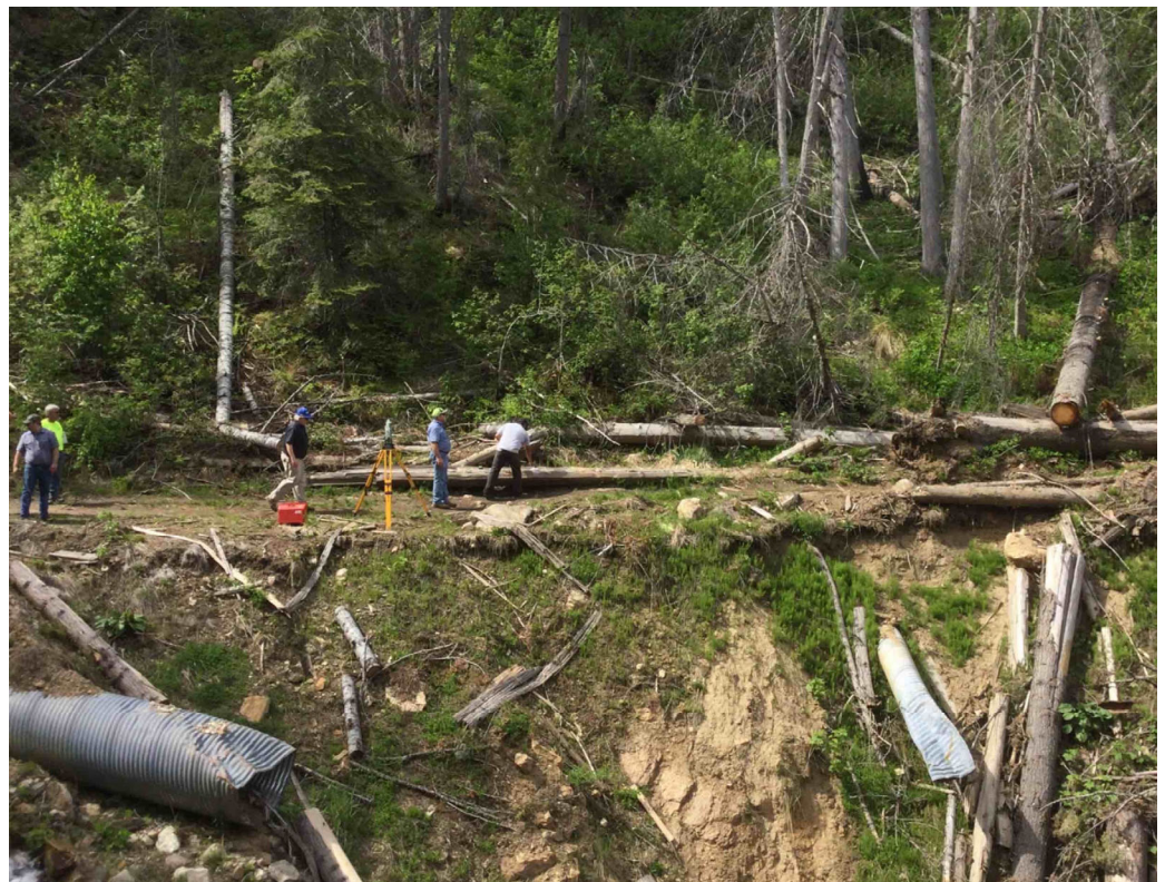
FS 443 MP 28.83