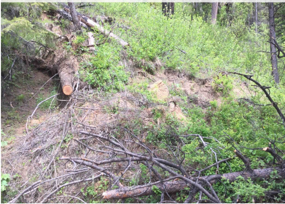
FS 319 MP 2