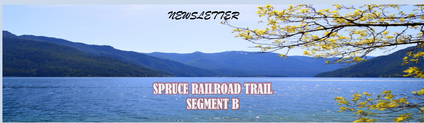
May 15, 2020