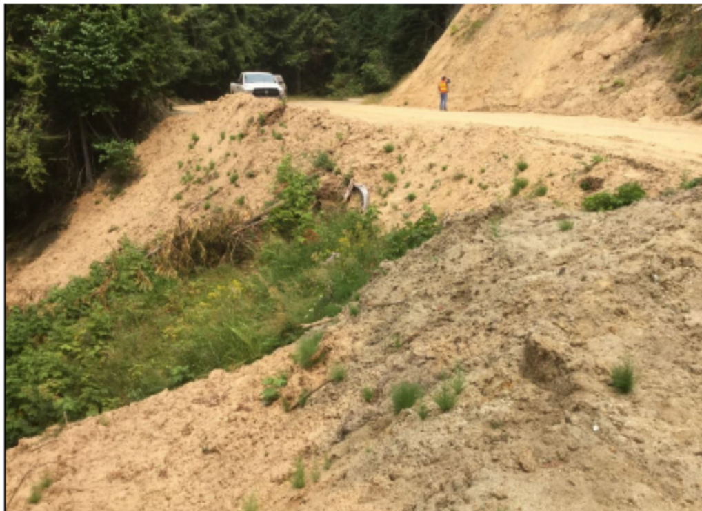
FSR 426 MP 0.5