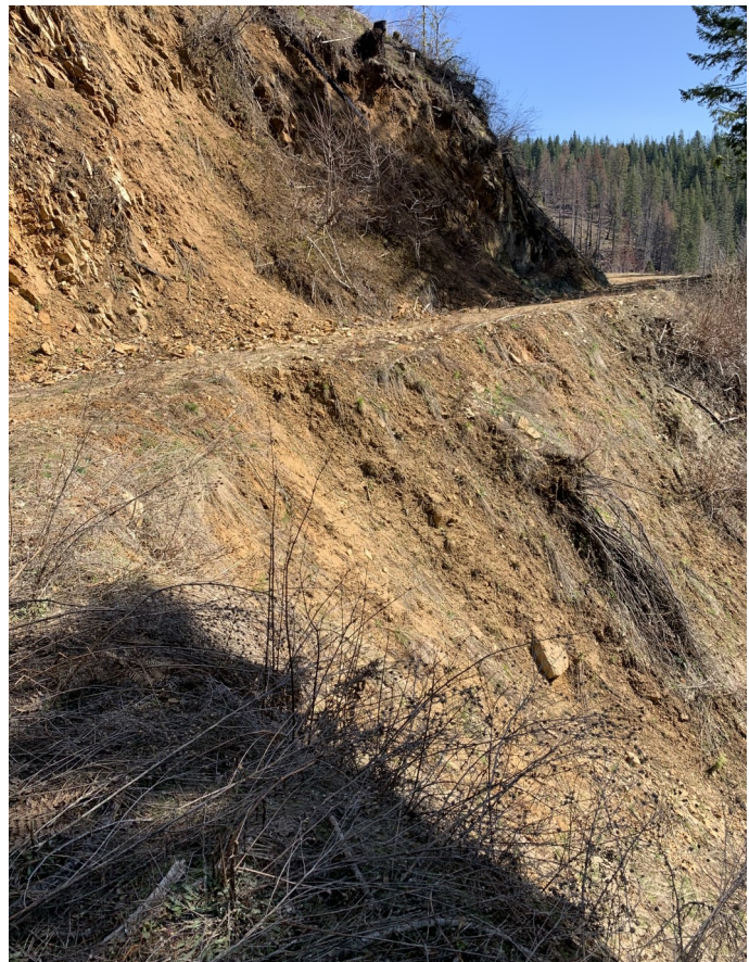
FSR 5503 MP 4.0