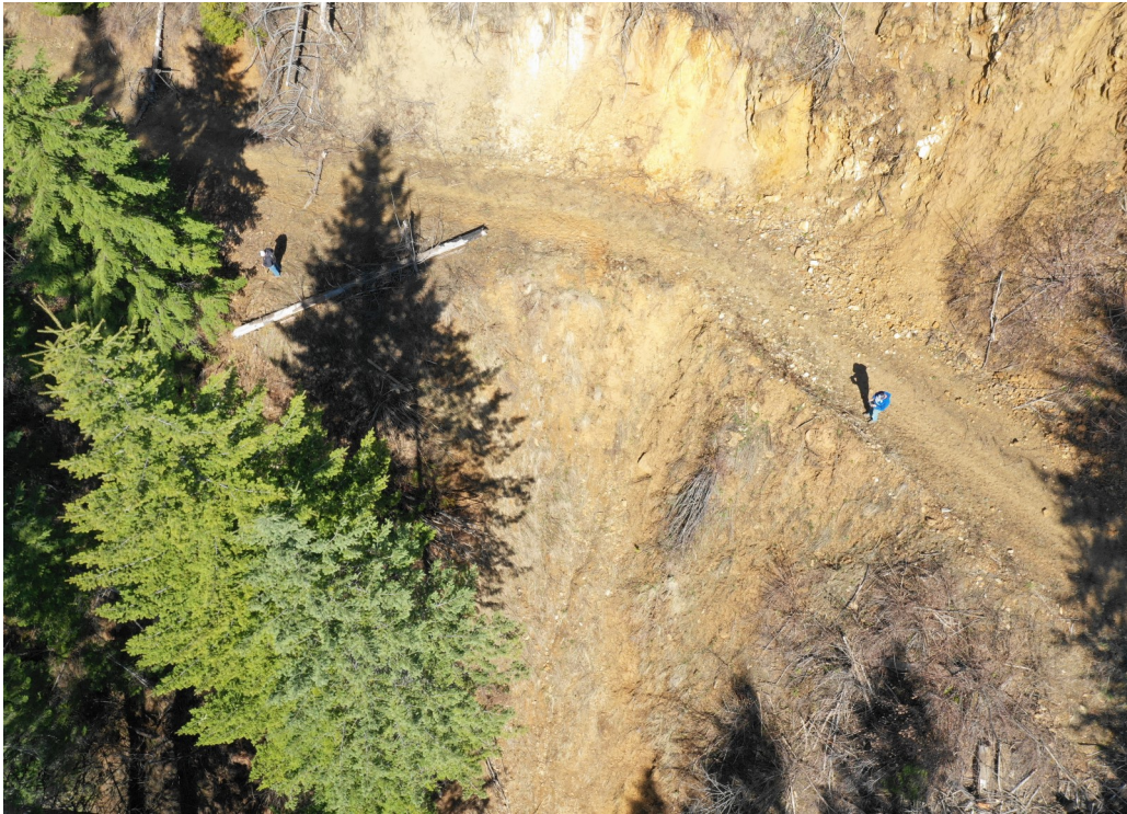
FSR 5503 MP 4.0