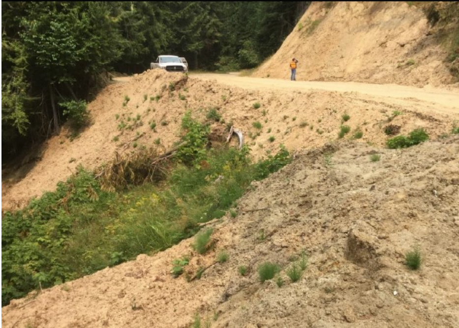
FSR 426 MP 0.5