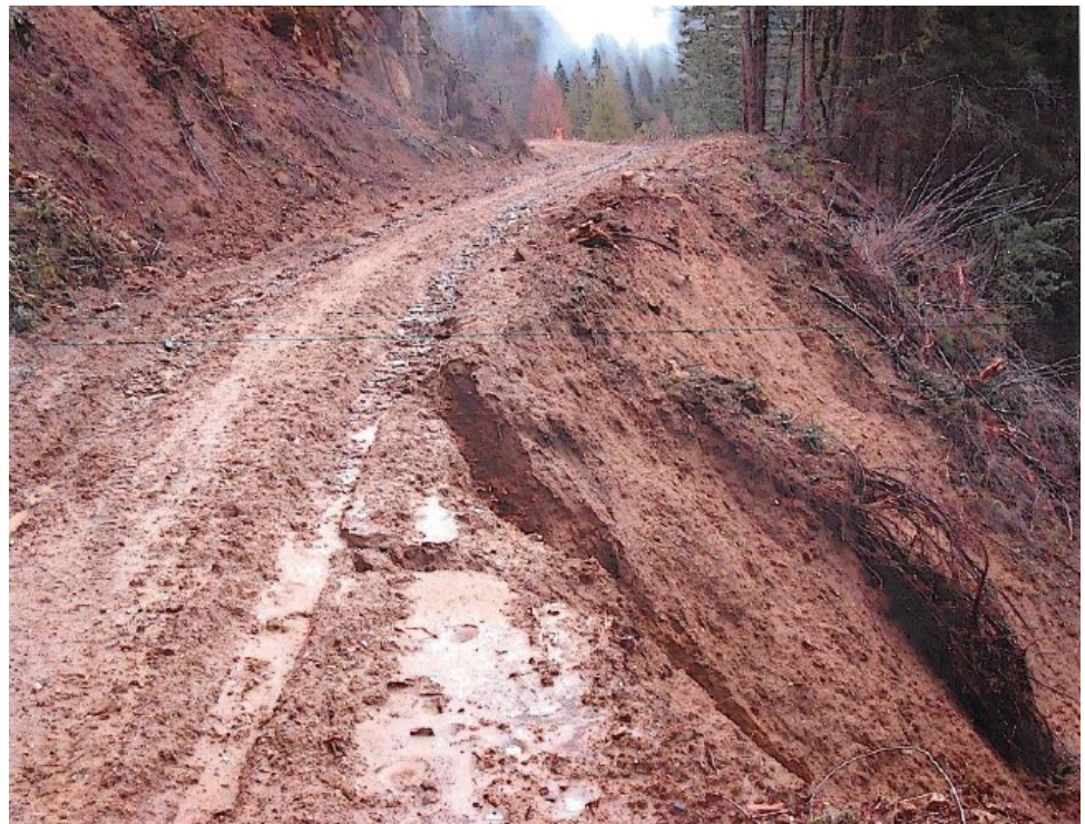
FSR 5503 MP 4.0