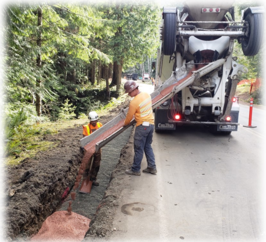
Duct installation for Fiber Optic

Lane closures: Monday—Thursday on Hurricane Ridge Rd.