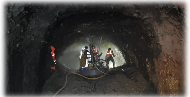
Right: Drilling rock dowels on East heading