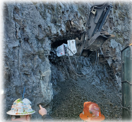
Left: Inspecting Adit 5 exterior excavation