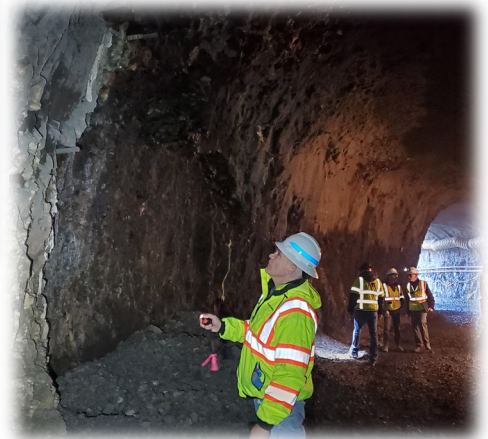
Right: Inspecting Adit 5 interior excavation